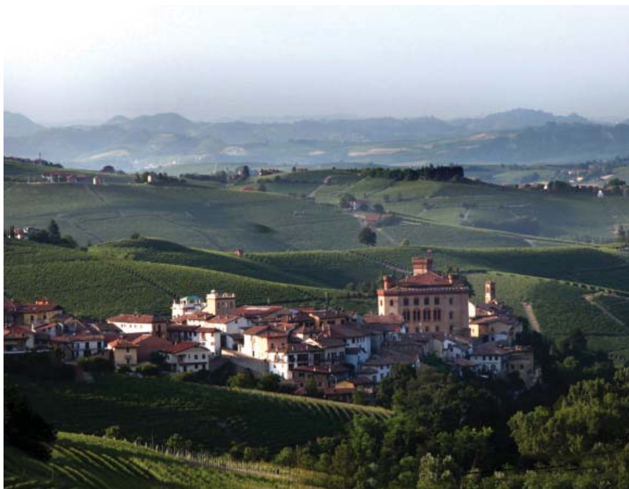
Barolo village and vineyards

A superb 4 night tour for up to 14 people accompanied by an experienced wine and food expert, discovering the land and the variety of the wines of Piemonte, including the renowned Barolo and Barbaresco.