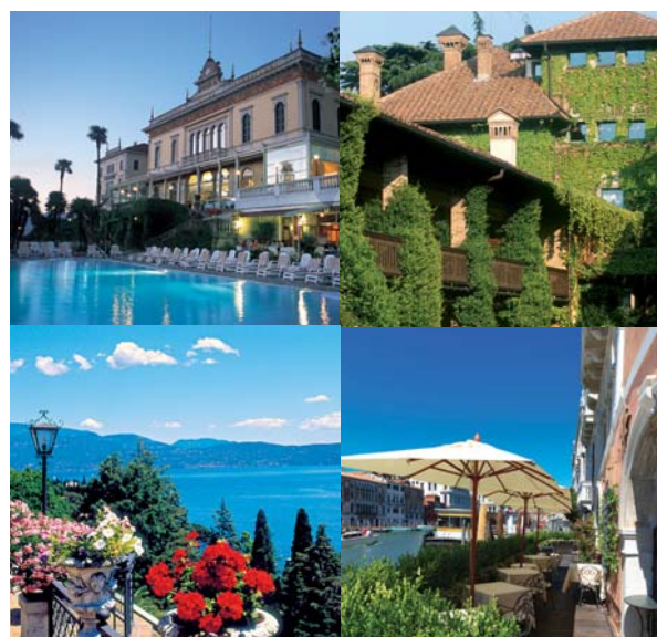
Top left Villa Serbelloni; top right L'Albereta; bottom left Villa del Sogno and Hotel Ca'Sagredo