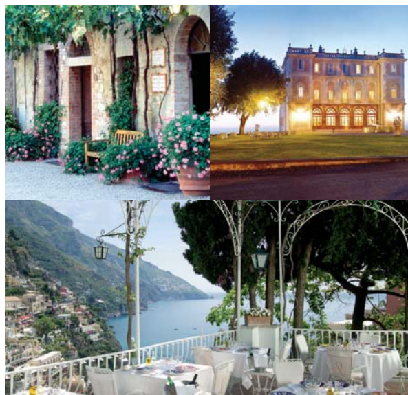
Top left Borgo San Felice; top right Villa Grazioli; bottom Hotel Poseidon