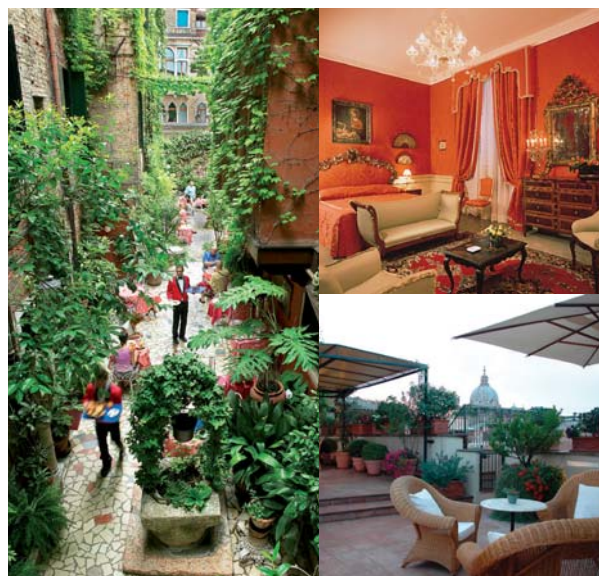
Hotel Flora; top right Helvetia and Bristol; bottom right Hotel d'Inghilterra