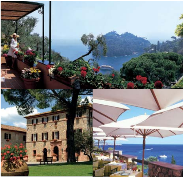
Top Hotel Splendido; bottom left Borgo San Felice; bottom right Il Pellicano

Use these suggestions as they are, or adapt them to suit your own tastes and budgets. Type A (standard or basic category) rooms are included unless otherwise stated. Don't forget, our well-established French Expressions brochure features over 80 hotels of character in 19 different regions of France, many of which are ideal as overnight stops or as part of a multi-centre holiday, split between France and Italy with perhaps Switzerland, Austria and Germany too en route.