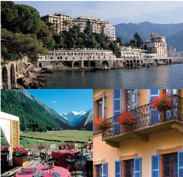
Clockwise from top: Excelsior Palace, Villa Beccaris, Hotel Bellevue