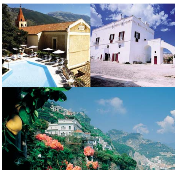
Clockwise from top left; Locanda delle Donne Monache, Masseria Torre Coccaro, Santa Caterina