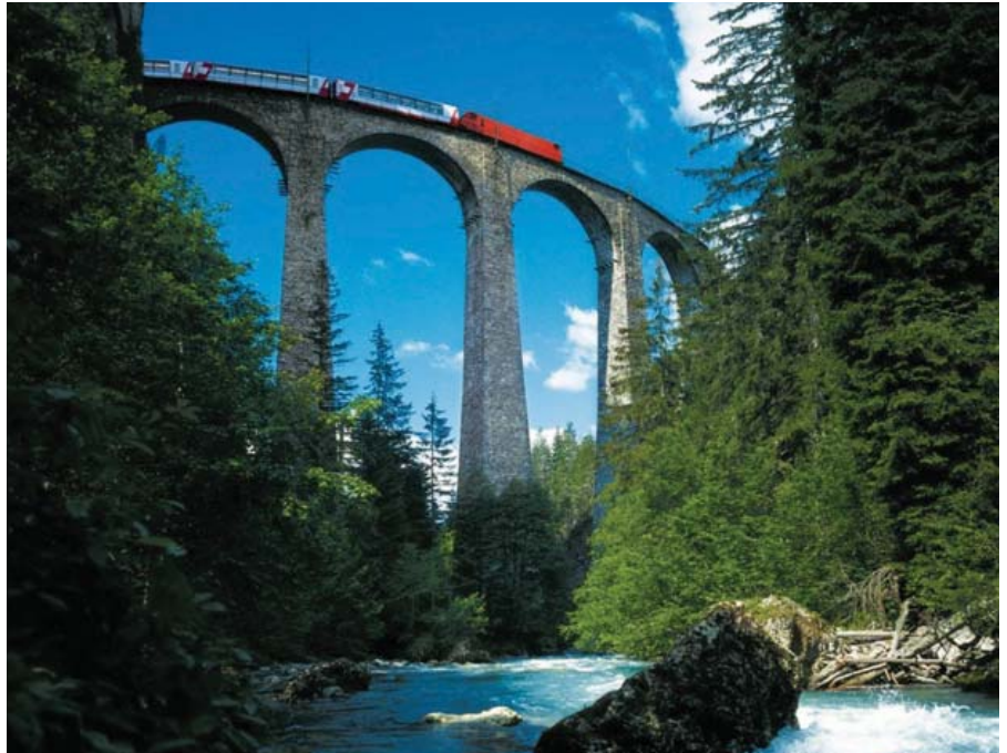
Landwasser Viaduct, Bernina Express

Change trains at Chur, Switzerland's oldest city, and join the pathway of the Bernina Express as it continues briefly west to Tamins, Rothenbrunnen, and Thusis. Notice the sheer white cliffs, hilltop towers, and gorges of the Ruinaulta as you traverse the area around the pretty ochre village of Tiefencastel. The train now sweeps back round to Filisur, passing through the railway town of Bergun, Samedan, Celerina, home to the Cresta Run, and finally arriving in St Moritz. Spend one night in St Moritz, staying in your choice of elegant hotel. Use the rest of your afternoon and the following morning to explore the quaint village of St Moritz. The dry, clear climate of the Upper Engadine Valley makes it the perfect winter sports resort, but also well-suited to long rambles, walks, and hikes across the undulating mountainside. Perhaps spend an hour or two wandering around the lake shore, admiring the mountains and the waterside, and uncovering shady groves, trickling waterfalls, and hidden caves. It is also possible to navigate higher up the mountains by rail, reaching the vantage points on the Piz Corvatsch and Chantarella at the top of the steep track. At Corviglia, a cable car takes you up to the Suvretta Mountain's most popular viewing point. Those looking for more thrilling and active experiences could partake in the water sports at Lake St Moritz or Lake Sils, or across at the high-altitude Lake Silvaplana, known for being windy.