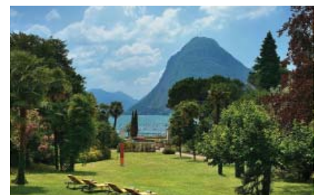
Grand Hotel Villa Castagnola, Lugano