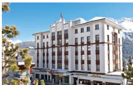
Hotel Schweizerhof St Moritz