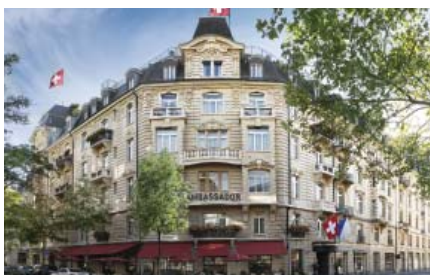
Hotel Ambassador a l'Opera, Zurich

Housed within a late 19th century mansion, the Grand Hotel Villa Castagnola channels aspects of Mediterranean culture in its pale-peach façade, its summery garden, and the dining experiences on offer. Guestrooms have wholly unique touches to ensure that every stay here is different, and the swimming pool, lounges, and bars encourage guests to keep returning. read more