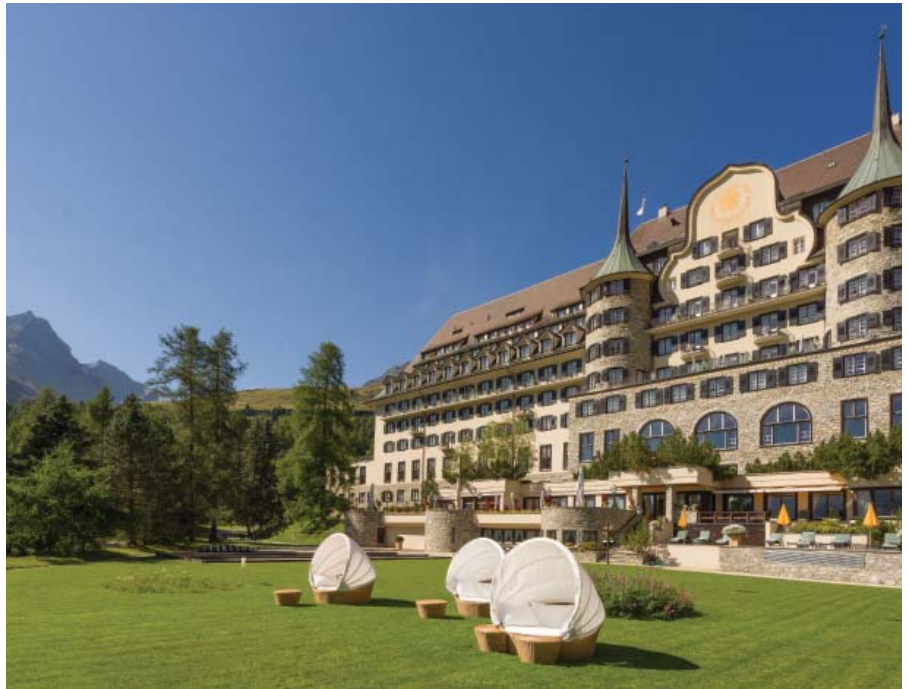
Suvretta House, St Moritz

Set on the banks of Lake Zurich, the Hotel Baur au Lac is equipped with a Michelin-starred restaurant, extensive tranquil parkland, and a rich, warm interior design. Guests can enjoy the beauty of the lake from the promenade or from a boat cruise, before returning to the hotel to enjoy the serene gardens, the chic luxurious indoor spaces, and the circular restaurant that juts out across the water. read more