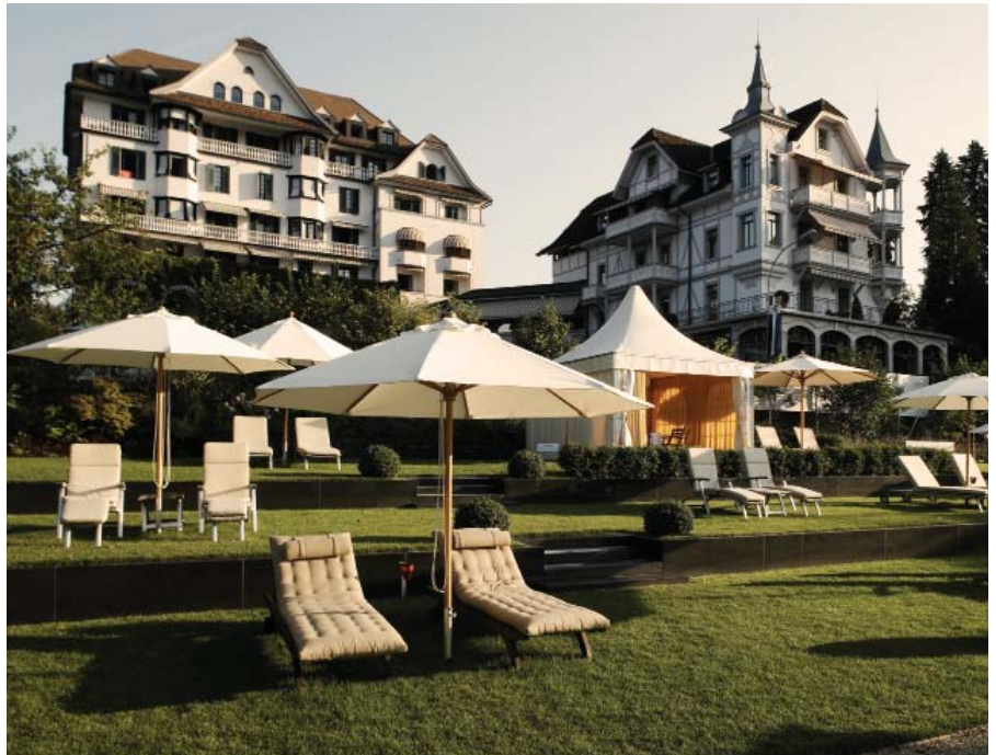
Hotel Park Weggis