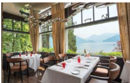
Hotel Grill Restaurant