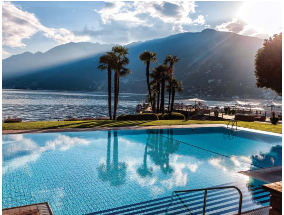
Eden Roc Hotel pool

scheme. All are spacious, with textured, tactile fabrics, and large windows and balconies that open up onto unbeatable views. For the ultimate Ascona experience, upgrade at the time of booking to a room with a direct lake view. The area around Ascona is perfect for day excursions, with plenty of cultural activities in neighbouring Locarno, and excellent train connections to cities such as Lugano, and Italianate Bellinzona. read more