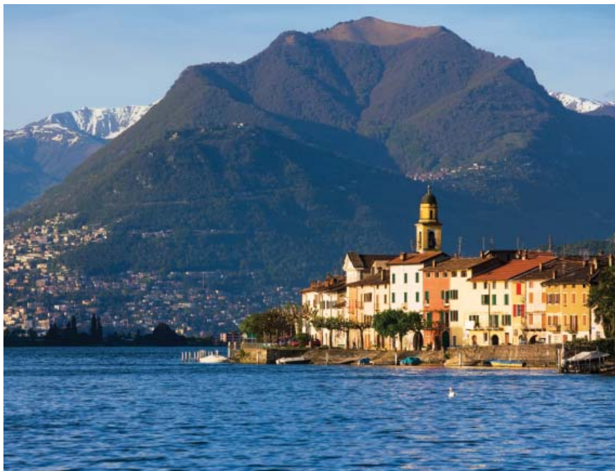
Lake Maggiore, Ticino