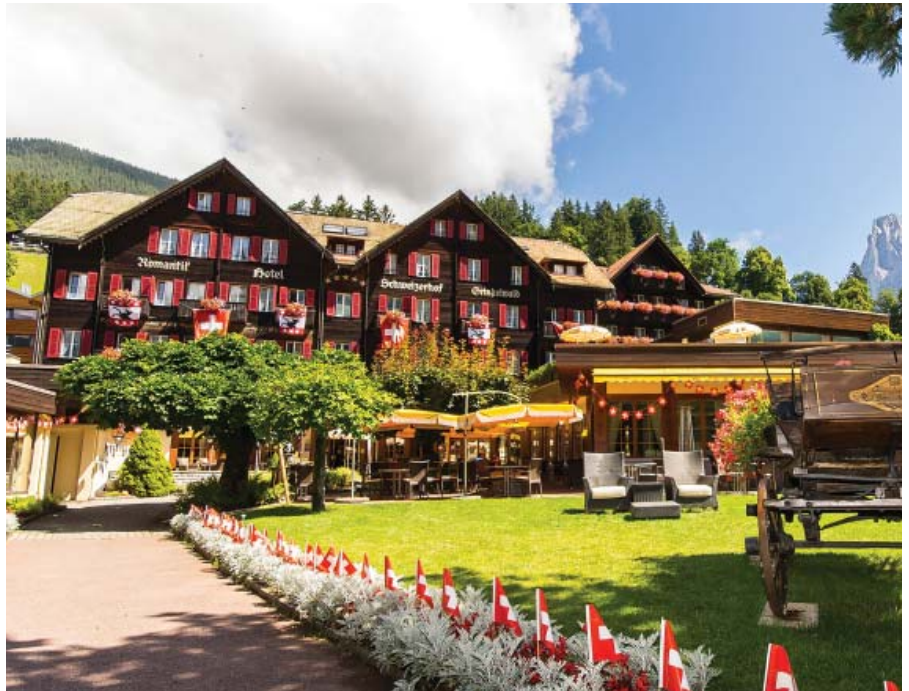
Romantik Hotel Schweizerhof

setting. In the summer, guests can also dine in the Schweizerhof Gardens, or on the romantic terrace. Hot drinks, aperitifs, and cocktails are served in the Hotel Bar throughout the day. The specially crafted Swiss wood seen on the exterior and in the rooms is used again in the bar to create the warm, welcoming feel of a mountain lodge. The Schweizerhof Spa is a chic haven of tranquillity, centred around the relaxing pool. Whirlpools and saunas, with atmospheric mood-lighting, are tucked into steamy corners, and indulgent massages and beauty treatments are administered in private treatment rooms. With two different hotel styles, which both channel two aspects of Swiss culture, the Romantik Hotel Schweizerhof has something to offer each of its guests. Luxurious accommodation, food, and spa facilities come together to create a truly special five star hotel. read more