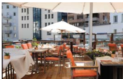
Hotel Schweizerhof St Moritz terrace