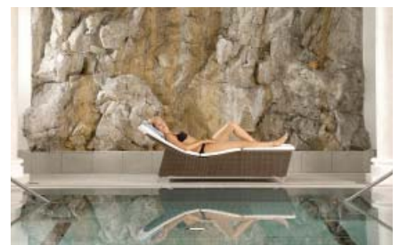
Kempinski Grand Hotel des Bains spa