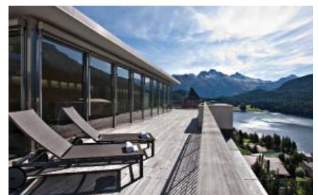
Hotel Schweizerhof St Moritz spa terrace