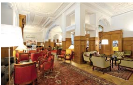
Hotel Schweizerhof St Moritz lobby