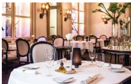
Kempinski Grand Hotel des Bains dining