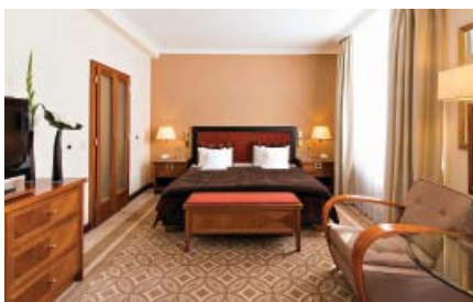
Kempinski Grand Hotel des Bains Guestroom

'Ca d'Oro,' awarded an impressive 15 Gault Millau points, specialises in innovative variations on traditional Italian dishes. Its combination of traditional sophistication, superior service, contemporary furnishings, and vibrant modern paintings creates an ambience which is both comfortable and stylish. The guestrooms are modern and welcoming, using the warm tones of cherry wood and a soft colour palette to soothe and contrast with the brilliance of the natural landscape outside. For the ultimate indulgent experience there are two opulent suites; located in the towers of the hotel, they are flawlessly appointed in refined colour schemes of golden tones, rich reds, and champagnes befitting royalty. The Kempinski Grand Hotel des Bains offers the discerning guest a luxurious pampering experience in an idyllic location throughout the year. read more