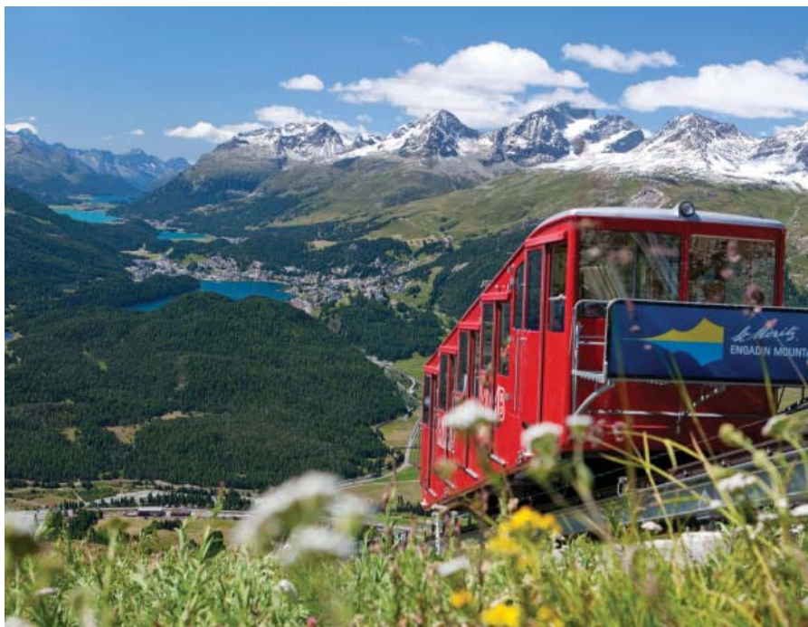
View over St Moritz

We recommend travelling to Switzerland by train from London to St Moritz, but return flights from the UK with rail travel in Switzerland can also be arranged. Your destination is St Moritz, in the shadow of the Suvretta Mountain and on the shores of the eponymous lake. Explore the surrounding mountain peaks on foot, by funicular railway, or cable car, taking in the views across the Valleys, the castles perched on high rocks, and the small villages hidden by forest. St Moritz itself has always been a popular winter destination, but its value extends into the summer months, as the snow thaws to reveal a network of hiking trails. The town itself is a chic collection of boutique shops and cafes, and gourmet restaurants. The rail journeys will be some of the highlights, be it the local services that meander through the valleys, or the grand Bernina Express.