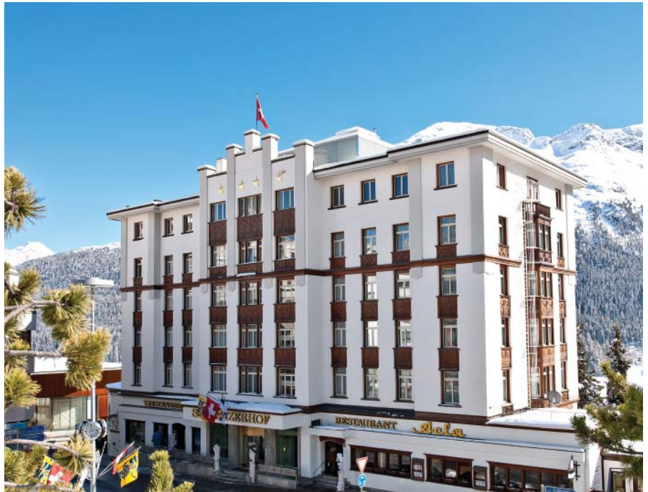
Hotel Schweizerhof St Moritz