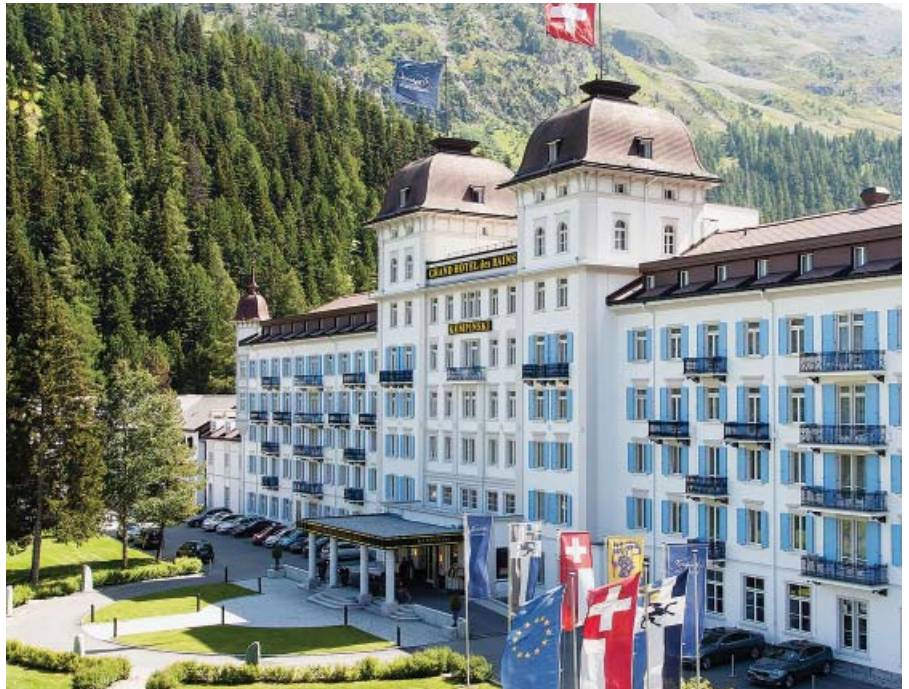
Kempinski Grand Hotel des Bains

'Ca d'Oro,' awarded an impressive 15 Gault Millau points, specialises in innovative variations on traditional Italian dishes. Its combination of traditional sophistication, superior service, contemporary furnishings, and vibrant modern paintings creates an ambience which is both comfortable and stylish. The guestrooms are modern and welcoming, using the warm tones of cherry wood and a soft colour palette to soothe and contrast with the brilliance of the natural landscape outside. For the ultimate indulgent experience there are two opulent suites; located in the towers of the hotel, they are flawlessly appointed in refined colour schemes of golden tones, rich reds, and champagnes befitting royalty. The Kempinski Grand Hotel des Bains offers the discerning guest a luxurious pampering experience in an idyllic location throughout the year. read more