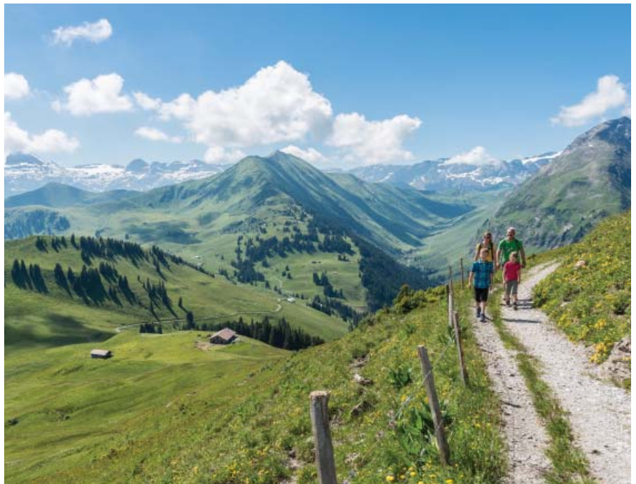
View of Horneggli

We recommend travelling to Switzerland by train from London to Geneva, and then on to Montreux to join the GoldenPass Line for the remainder of the journey to the Saanenland. Return flights from the UK with rail travel in Switzerland can also be arranged. Your destination is Schoenried; a peaceful, mountainside village with stunning views across the five converging valleys. Less than 2 miles away is Gstaad, the popular winter and summer sports destination, known for its main street lined with chalet houses and boutique shops. Rustic restaurants populate the villages and undulating green slopes; streams navigate their way between the mountains; and cable cars, railways, and hiking paths guide you across this fantastic landscape. Use your Swiss rail pass to travel around the villages and towns, stopping in Gstaad, Lauenen, and Zweisimmen.