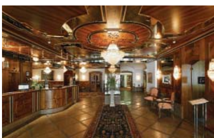
Grand Hotel Zermatterhof lobby

at the end of a day exploring Zermatt. The Alpine Spa is perfect for whiling away a few hours one afternoon or morning; equipped with swimming pool and waterfalls, soothing treatment rooms, a cosy lounge, an intriguing ice grotto, and a range of saunas that promote different aspects of wellbeing. Guests are sure to finish their stay here feeling rejuvenated and revived. read more