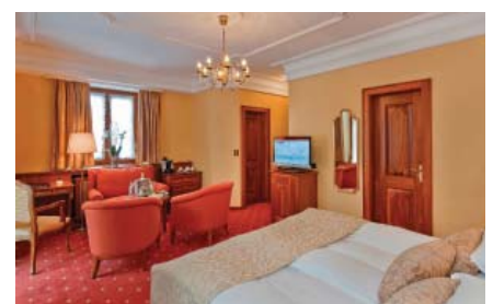
Grand Hotel Zermatterhof Deluxe Double Room