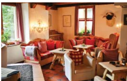
Romantik Hotel Julen bar

family's other Zermatt hotels: the Hotel Alpenhof, and the Hotel Daniela. The brand new Papperla Pub, just across the road from Hotel Julen, for example, is the perfect place to spend the evenings, with live music, international guests, and a lively atmosphere. The Romantik Hotel Julen offers an authentic and memorable taste of traditional Swiss lifestyle, with many quirky characteristics and a very welcoming vibe. read more