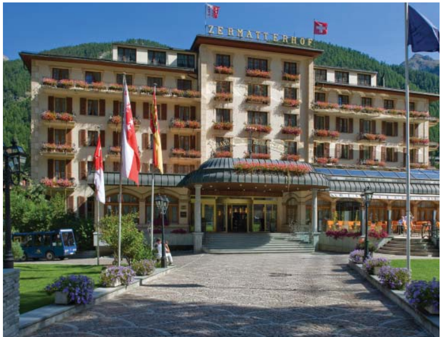
Grand Hotel Zermatterhof

at the end of a day exploring Zermatt. The Alpine Spa is perfect for whiling away a few hours one afternoon or morning; equipped with swimming pool and waterfalls, soothing treatment rooms, a cosy lounge, an intriguing ice grotto, and a range of saunas that promote different aspects of wellbeing. Guests are sure to finish their stay here feeling rejuvenated and revived. read more