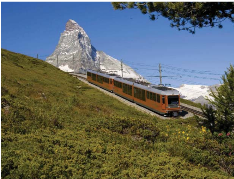
Gornergratbahn above Zermatt