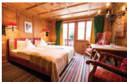
Romantik Hotel Julen Guestroom