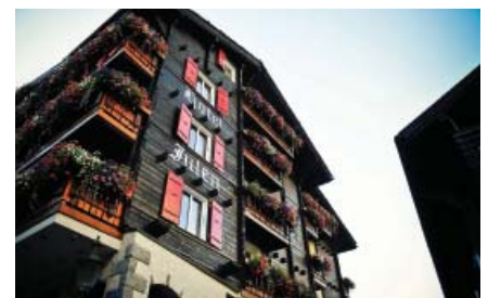
Romantik Hotel Julen