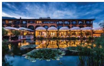
Giardino Ascona, Ascona

Well-positioned in Bern, the Hotel Kreuz offers good value for money, convenience, and comfortable accommodation. The cosy restaurant serves up expertly-cooked Swiss delicacies, which can be followed up with relaxing drinks in the lounge bar. read more