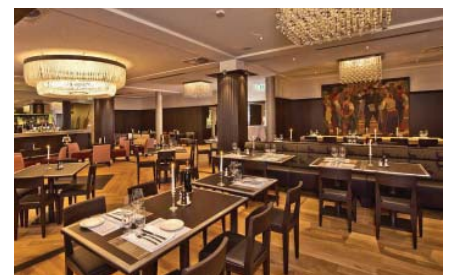
Hotel Bern, Bern

A sophisticated hotel that blends grandeur with modern style, the Hotel Schweizerhof Bern is a veritable jewel in the capital. Guestrooms and public rooms are lit by flickering fireplaces and the occasional glass chandelier. Warm, neutral colours prevail, be it in the plush sofas, the intricately embroidered bed throws, the guestroom feature walls, or the leather armchairs. An elegant restaurant and well-equipped spa completes the luxury experience. read more