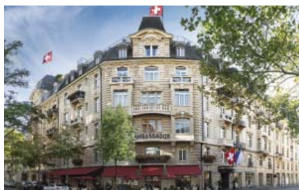
Ambassador a l'Opera, Zurich

Possessing all the charm, character, and personalised service of a boutique hotel, this four star option in Ascona looks out across Lake Maggiore with a distinctly Mediterranean façade. This intimate converted castle still has its original tower, in which some of its rooms are held, though the dining room is of a particularly contemporary design. read more