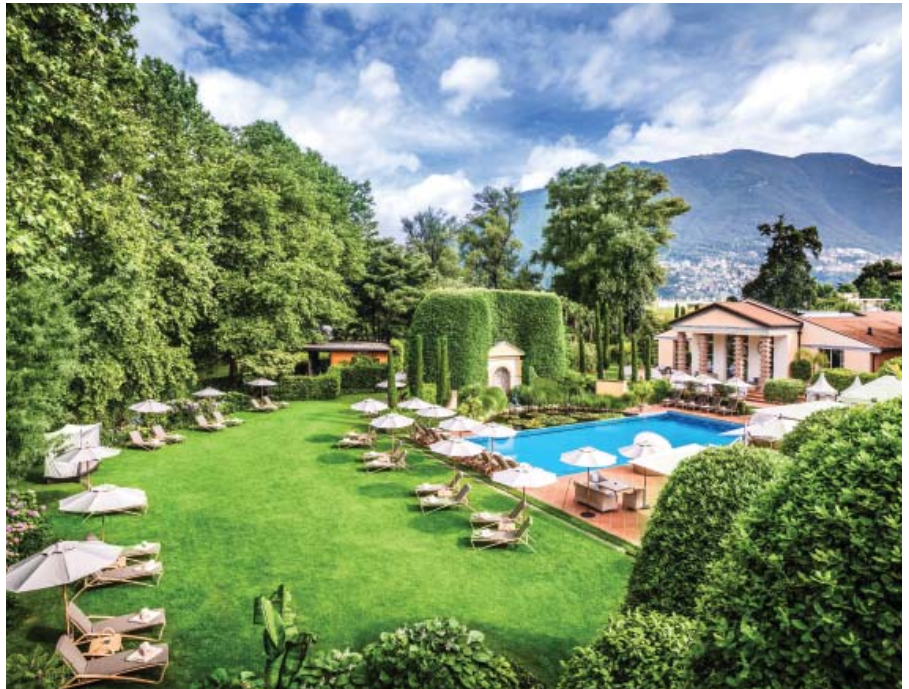
Giardino Ascona, Ascona