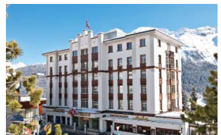
Hotel Schweizerhof St Moritz