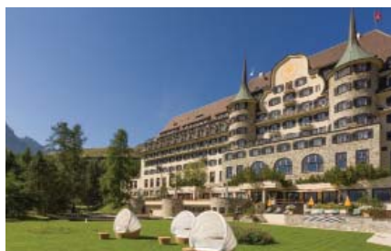
Suvretta House, St Moritz