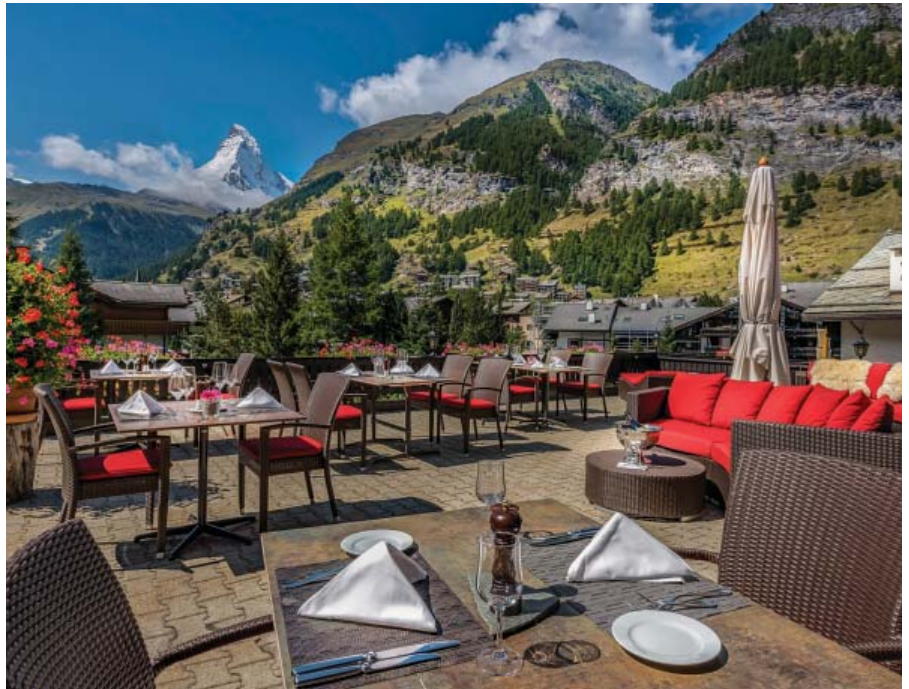
Hotel Christiania, Zermatt

A historic, chic property, the Grand Hotel Zermatterhof may well be the most prestigious hotel in Zermatt. Positioned in the centre of the village, it is just a minute's walk from the main church, a park, the best restaurants in Zermatt, and the Matter Vispa. The rooms blend state-of-the-art comfort with regal charm. read more