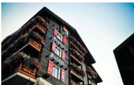
Romantik Hotel Julen, Zermatt

At the foot of the mountain that gives it its name, Suvretta House is a stunning, palatial hotel that offers its guests excellent regional cuisine, including some Swiss favourites, a tranquil spa with 25m swimming pool, and spacious, refined accommodation with a regal touch. read more