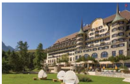
Suvretta House, St Moritz