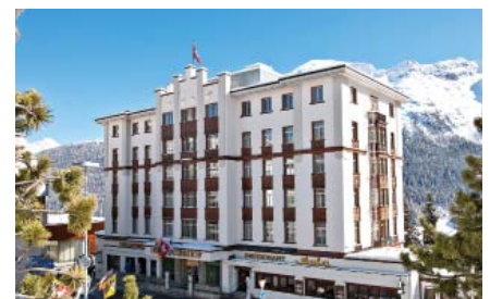
Hotel Schweizerhof St Moritz