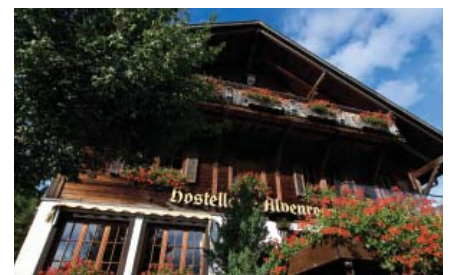
Hotel Alpenrose, Schoenried