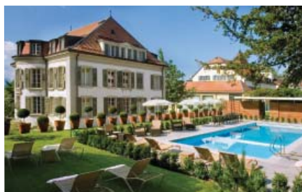
Angleterre et Residence, Lausanne