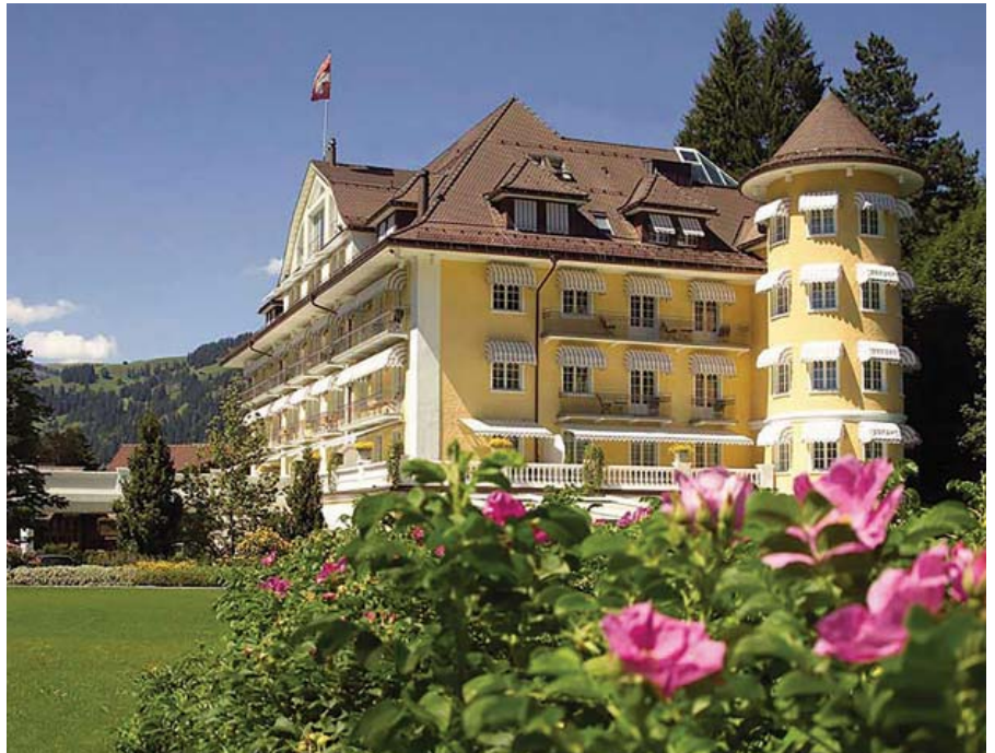
Le Grand Bellevue, Gstaad

Just a short walk from Gstaad's main boutiques, cafes, and restaurants, Le Grand Bellevue is a highly convenient hotel immersed in the picturesque lifestyle of the Saanenland. Its pale yellow façade is palatial in design, with a distinctive tower that shapes some of the hotel suites. Equipped with a Michelin starred restaurant and an indulgent spa, this is a luxurious property in which to spend two or three nights while you explore the Saanenland. read more