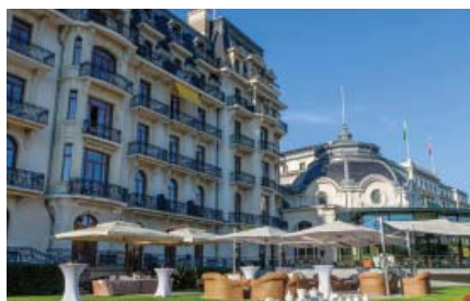
Beau Rivage Palace, Lausanne