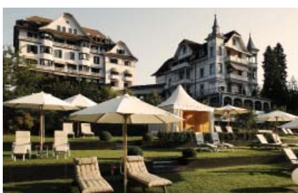
Hotel Park Weggis, Weggis

Just a short walk from Gstaad's main boutiques, cafes, and restaurants, Le Grand Bellevue is a highly convenient hotel immersed in the picturesque lifestyle of the Saanenland. Its pale yellow façade is palatial in design, with a distinctive tower that shapes some of the hotel suites. Equipped with a Michelin starred restaurant and an indulgent spa, this is a luxurious property in which to spend two or three nights while you explore the Saanenland. read more