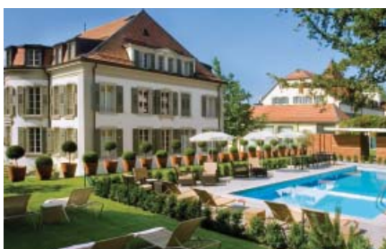
Hotel Angleterre et Residence, Lausanne

Housed within a late 19th century mansion, the Grand Hotel Villa Castagnola channels aspects of Mediterranean culture in its pale-peach façade, its summery garden, and the dining experiences on offer. Guestrooms have wholly unique touches to ensure that every stay here is different, and the swimming pool, lounges, and bars encourage guests to keep returning. read more