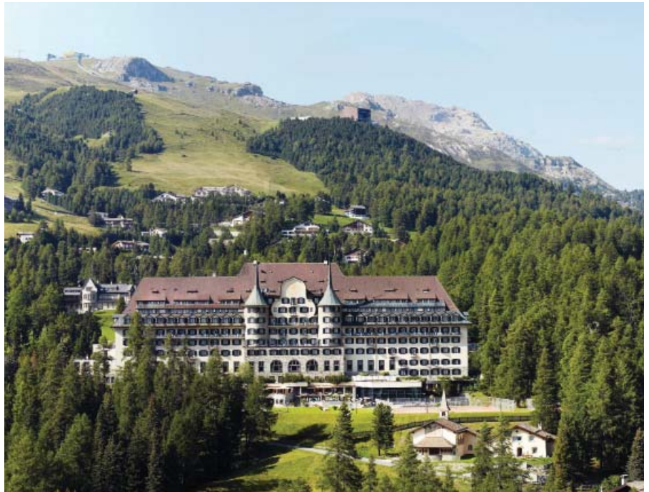
Suvretta House, St Moritz

A historic, chic property, the Grand Hotel Zermatterhof may well be the most prestigious hotel in Zermatt. Positioned in the centre of the village, it is just a minute's walk from the main church, a park, the best restaurants in Zermatt, and the Matter Vispa. The rooms blend state-of-the-art comfort with regal charm. read more