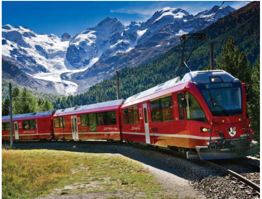
Montebello Curve, Bernina Express

This grand tour of Switzerland encompasses all the highlights of this diverse country. Travel past stunning mountainscapes, sublime lakes, and creaking glaciers on iconic railway lines; stop off in unique, enchanting lakeside cities; and spend cosy evenings in quaint, chocolate-box villages beneath imposing mountains such as the Matterhorn.