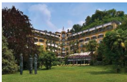
Grand Hotel Villa Castagnola, Lugano