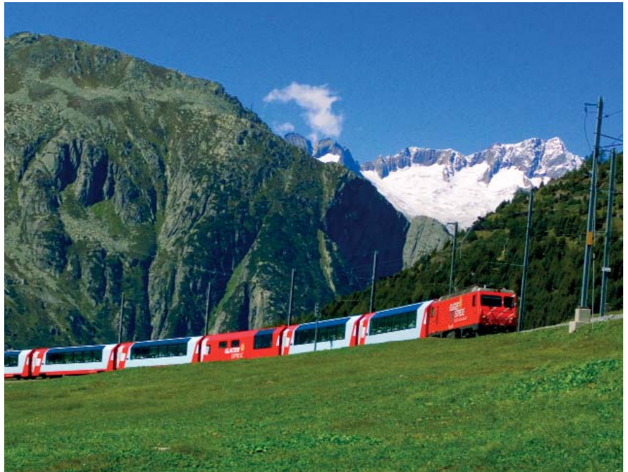
The Glacier Express

Day Two takes you on to Zermatt. This train journey takes just shy of three hours, passing the 80 hectares of the stunning Lavaux Terraced Vineyards, Montreux and Chillon Castle, Martigny, and pausing at Visp while you change trains. As you enter Zermatt, the area's crowning glory will make itself apparent: the Matterhorn. Around it, over 400km of walking and hiking paths vein the landscape, allowing you to capture stunning panoramas of both Zermatt and the Matterhorn while uncovering more of the Alpine flora and fauna. Small railways from Zermatt take you high up into the mountains, reaching 3000m above sea level, and the Glacier Paradise cable car transports you up to Europe's highest viewing platform. To extend both your experience of the railways of Valais and the mountains, take the Gornergratbahn up to the summit of the Gornergrat, from where you can bask in views of 38 mountain peaks. Consider visiting the Hornlihutte, where for decades climbers have famously stayed as they prepare to climb the Matterhorn, via the Hornli Ridge, the