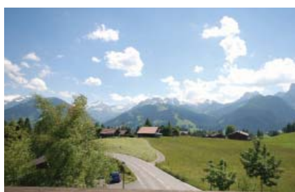
View from Hotel Alpenrose, Schoenried