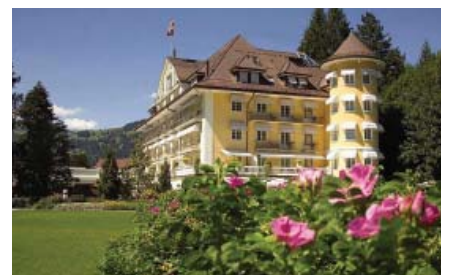
Le Grand Bellevue, Gstaad