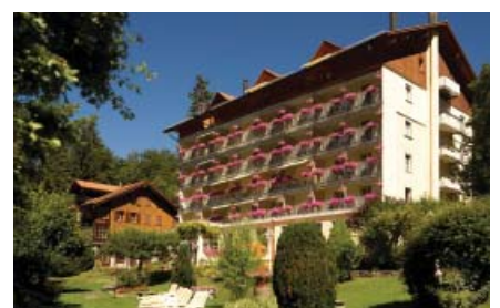
Hotel Wengener Hof, Wengen