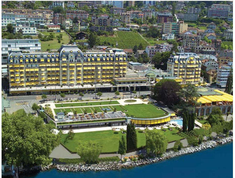
Fairmont le Montreux Palace, Montreux

This startling luxury hotel stands right on the banks of Lake Geneva. The Willow Stream Spa, the 3 restaurants and 4 bars, and the beautifully appointed rooms make this hotel a highly rewarding five star option for stays in Montreux. The Belle Epoque design reflects the building's history, while setting the tone for the sophistication and elegance that lies within. read more