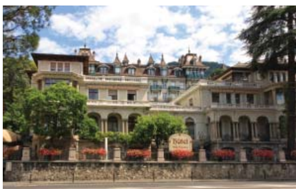
Villa Toscane, Montreux