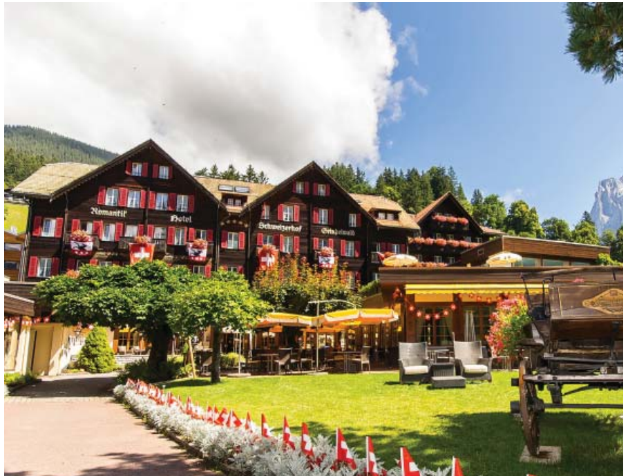
Romantik Hotel Schweizerhof, Grindelwald

A majestic Swiss chateau on the banks of Lake Lucerne, the Hotel Park Weggis offers its guests spa facilities, fantastic views, a lakeside veranda for dining, and light, sophisticated accommodation. This is a peaceful village alternative to accommodation within Lucerne, but still with excellent access to the city itself. read more