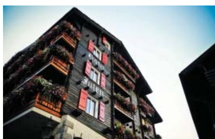
Romantik Hotel Julen, Zermatt