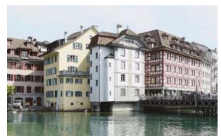
Hotel Wilden Mann, Lucerne