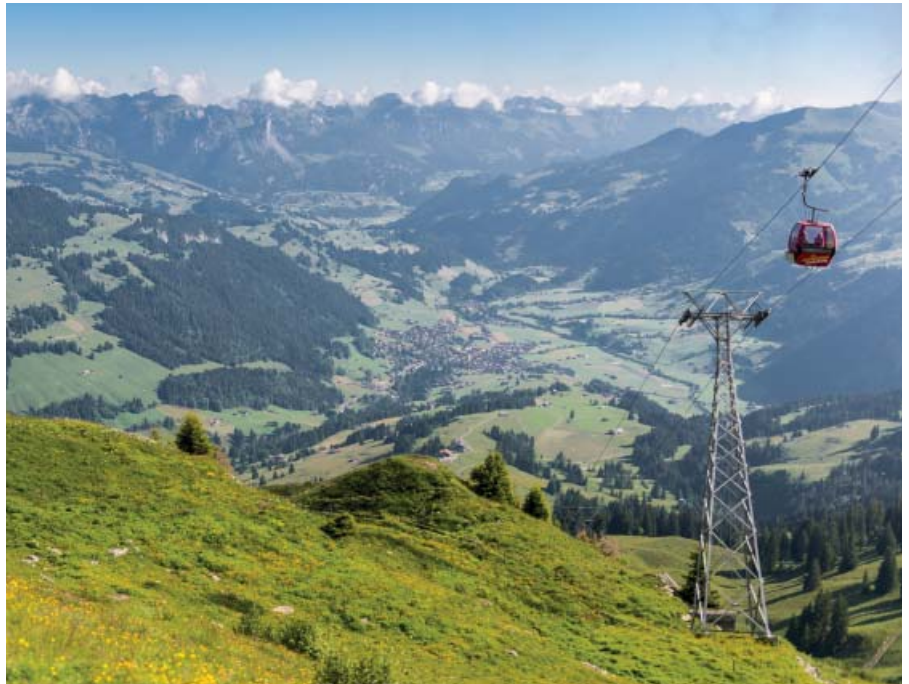
Rinderberg and Saanenland

In the late morning of your fourteenth day, board the GoldenPass Line for the two hour journey from Schoenried to Montreux. After passing through Gstaad, the GoldenPass Line crosses the border into Vaud, stopping first in Rougemont, and then Chateau-d'Oex. Here the mountainscapes are dotted with quaint chalets, small churches, and petit castles; an image that is very typical of the Pays-d'Enhaut. The villages you will pass next all retain their own individual architectural character, emerging out of plumes of evergreen trees. In Rossiniere and Montbovon, passengers can view the startling translucent turquoise water that runs in rivers crossed by ancient wooden bridges. At Les Avants, the train begins to wind its way down the hillside towards Montreux, where you will stay for