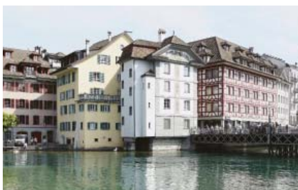
Hotel Wilden Mann, Lucerne

This waterfront hotel in Montreux offers a boutique experience, but with the use of the excellent spa and dining facilities at the Villa Toscane's sister hotel, the Royal Plaza Montreux & Spa. The art nouveau façade is defined by its pillars, arched windows, and dormer windows, and is surrounded by an abundance of plants. Inside, the rooms are light, airy, and welcoming, with subtle, colourful touches. read more