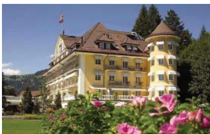
Le Grand Bellevue, Gstaad