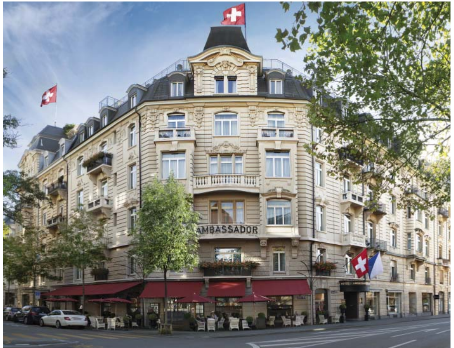
Hotel Ambassador a l'Opera, Zurich

Set on the banks of Lake Zurich, the Hotel Baur au Lac is equipped with a Michelin-starred restaurant, extensive tranquil parkland, and a rich, warm interior design. Guests can enjoy the beauty of the lake from the promenade or from a boat cruise, before returning to the hotel to enjoy the serene gardens, the chic luxurious indoor spaces, and the circular restaurant that juts out across the water. read more