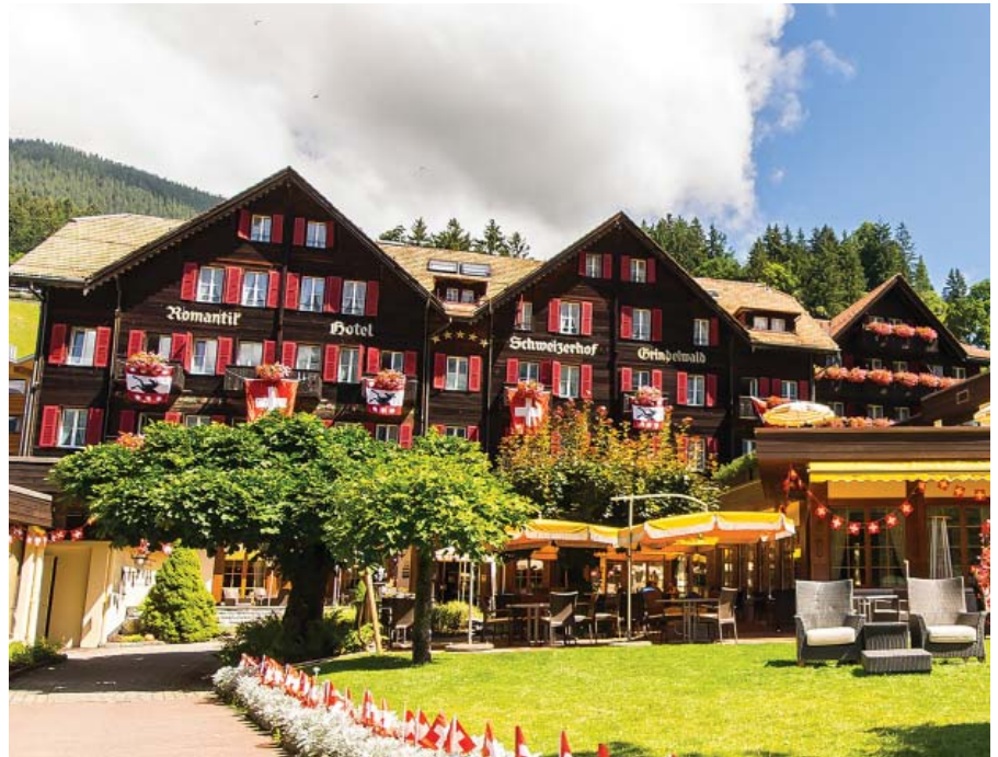
Romantik Hotel Schweizerhof, Grindelwald

This attractive, traditional hotel has an abundance of authentic Swiss character, from the dark wood chalet exterior, to the rich, cosy colours of the interiors. A 'stubi' style restaurant serves guests a range of Swiss specialities, a comfortable lounge and a picturesque garden provide hours of relaxation, and the idyllic spa offers a place to relax after a day exploring the mountains of the Bernese Oberland. read more