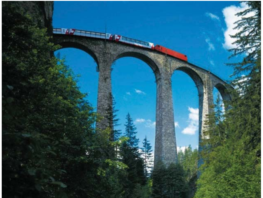
The Bernina Express

If you are arriving from or returning to the UK by rail, we would recommend spending an extra night in Zurich at the beginning or end of your tour. It is also possible to add additional nights in any of the destinations mentioned.