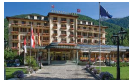
Grand Hotel Zermatterhof, Zermatt