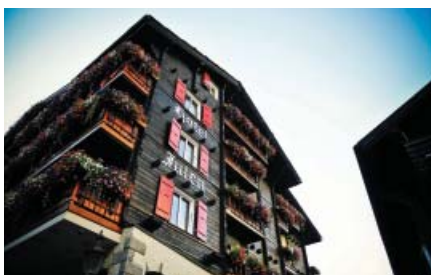
Romantik Hotel Julen, Zermatt

This timeless townhouse is situated within easy reach of Chur's famous Old Town. White shutters frame the tall windows, and the combination of pink and white stucco gives this building a very pretty aspect. Guests here are treated to a real taste of authentic Switzerland, in the light, yet rustic bedrooms, and in the 'stubli' restaurant, which serves a range of Alpine delicacies. read more