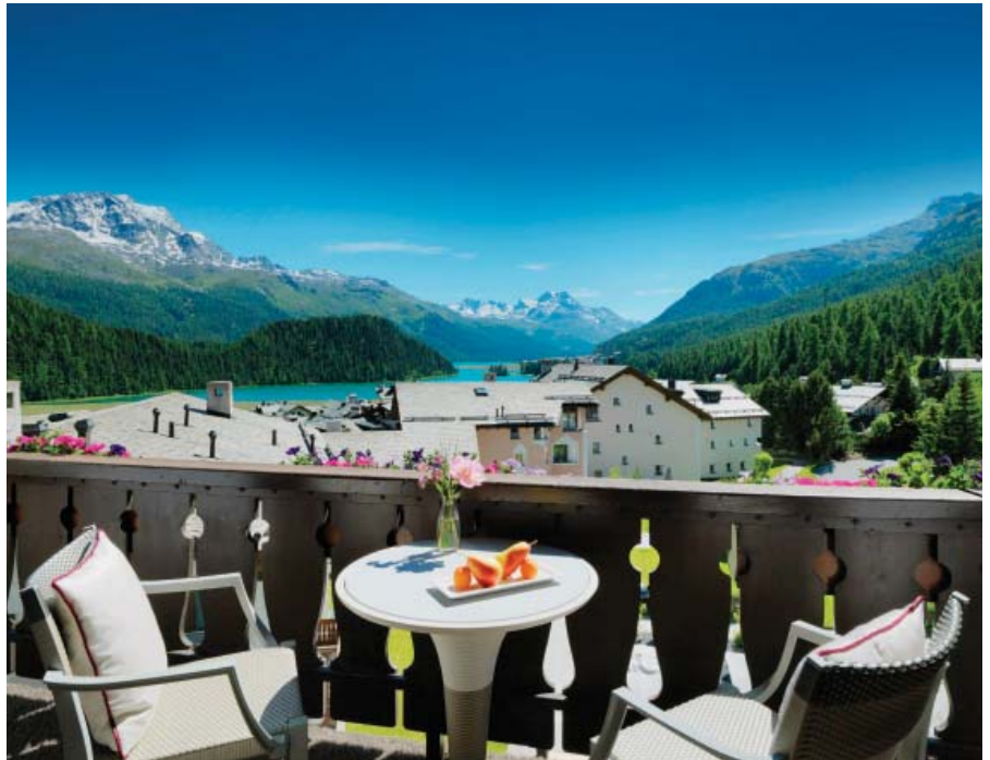
Giardino Mountain, St Moritz

Built around traditional Swiss elements, this hotel provides simplistic luxuries in an area rich with gourmet restaurants. Inside the hotel, guests experience cosy, warm rooms, sleek, monochrome suites, and an unrelenting attention to detail. read more