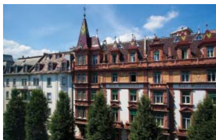
Hotel Waldstaeetterhof, Lucerne