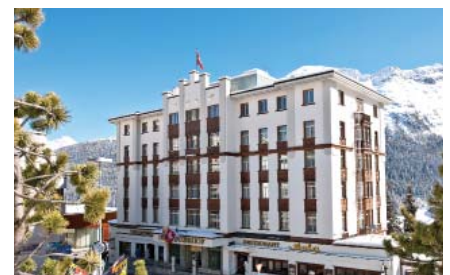
Hotel Schweizerhof St Moritz, St Moritz