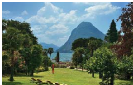
Grand Hotel Villa Castagnola, Lugano