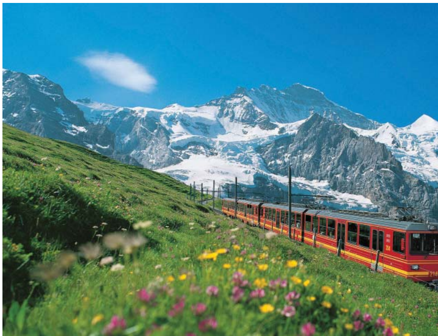
In the Bernese Oberland

On Day Ten, board one of the distinctive carriages of the Glacier Express to Andermatt, where you change trains on your way to Lugano. This short stretch of the Glacier Express takes you first through the enchanting village of St Niklaus, defined by its rustic chalet houses with peaked roofs, and then onto Brig, where the 17th century Stockalper Castle stands proudly at the centre of the Old Town, crowned by unusual onion domes. The Glacier Express then takes you through the Furka Tunnel of the Furka Steam Railway, past the