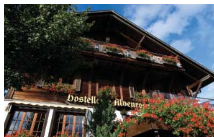
Hotel Alpenrose, Schoenried