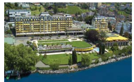
Fairmont le Montreux Palace, Montreux