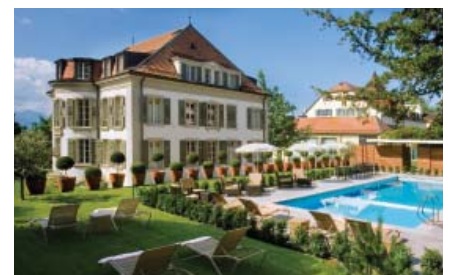
Hotel Angleterre et Residence, Lausanne