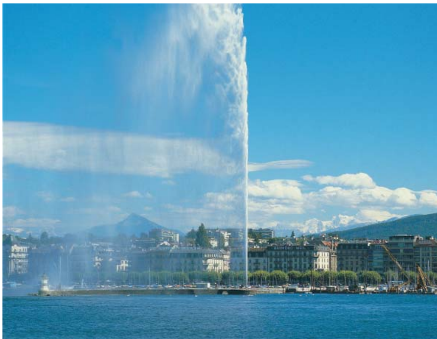
Jet d'Eau in Lake Geneva

Linking together the most breath-taking and sublime lakes in Switzerland, this grand tour stops off beside the four main Swiss lakes, plus the lesser-known lakes of St Moritz, Sils, Silvaplana, Fallboden, Thun, and Brienz. We aim to capture in this rail touring holiday the various sides to these lakes as well as the diverse villages, towns, and cities that line their shores.