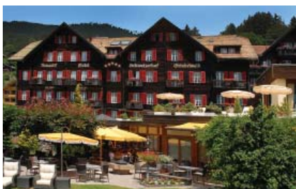
Romantik Hotel Schweizerhof, Grindelwald

A majestic Swiss chateau on the banks of Lake Lucerne, the Hotel Park Weggis offers its guests spa facilities, fantastic views, a lakeside veranda for dining, and light, sophisticated accommodation. This is a peaceful village alternative to accommodation within Lucerne, but still with excellent access to the city itself. read more