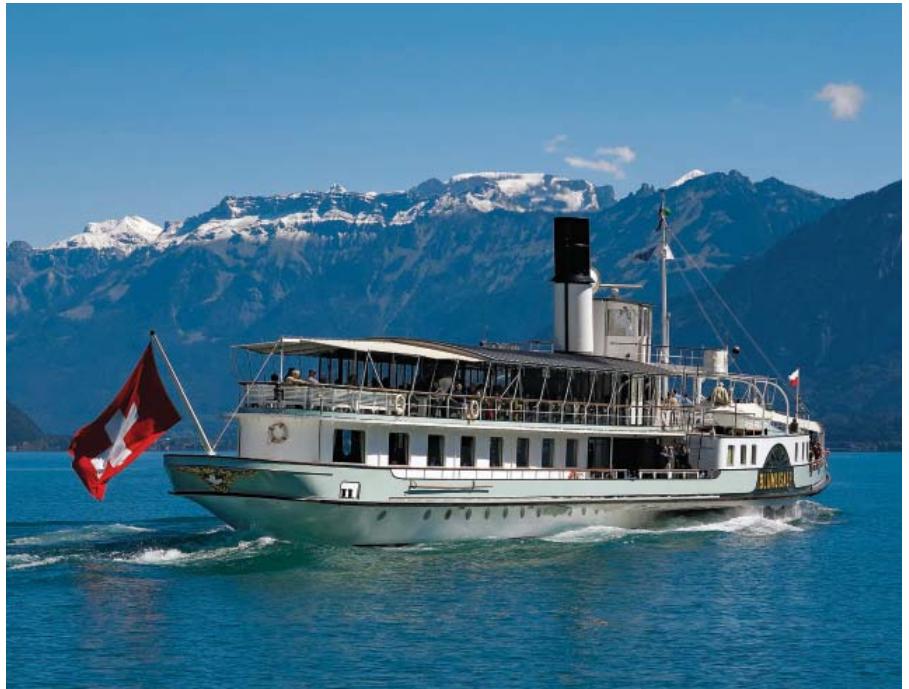
Lake Thun in the Bernese Oberland

The next leg of your journey takes you to the eastern point of Lake Geneva, in Montreux, home to Chillon Castle, Switzerland's most popular historical monument. In Montreux, change trains to the GoldenPass Line and zig-zag your way up to higher ground as you begin the journey to Grindelwald in the Bernese Oberland. The distinctive golden carriages of the GoldenPass Line take you first through the villages above Montreux, where the houses become sparser and have more individualistic architecture. Pass the turquoise waters and wooden bridges of Montbovon and enter Saanenland in Chateau d'Oex, where the mountain chalets begin to become more prominent. Emerge from a gently curving valley into the flat plains around Gstaad that are formed by the convergence of five valleys. Ascend to Schoenried, and then to Zweisimmen, the so-called 'gateway' to the Saanenland. The landscape here becomes jagged as severe bluffs and mountain peaks burst out of areas of thick, rich forest. The Stockhorn Rock between Boltigen and