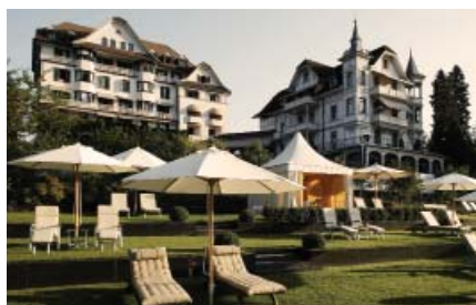
Hotel Park Weggis, Lake Lucerne