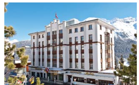
Hotel Schweizerhof St Moritz