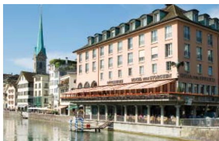
Hotel Storchen, Zurich