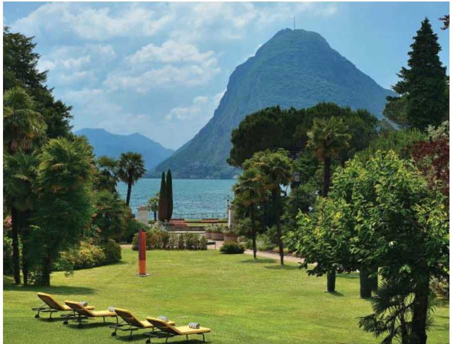
Grand Hotel Villa Castagnola, Lugano

Housed within a late 19th century mansion, the Grand Hotel Villa Castagnola channels aspects of Mediterranean culture in its pale-peach façade, its summery garden, and the dining experiences on offer. Guestrooms have wholly unique touches to ensure that every stay here is different, and the swimming pool, lounges, and bars encourage guests to keep returning. read more