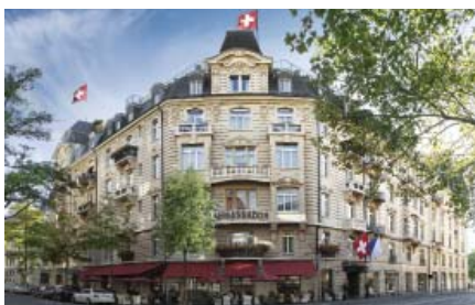
Hotel Ambassador a l'Opera, Zurich

This three star option in the centre of Zurich offers sophisticated and quirky accommodation in a hotel that adopts a cinema theme. Rooms are therefore suitably glamorous, with wholly unique features and excellent access to Lake Zurich and the city's important cultural sites. read more