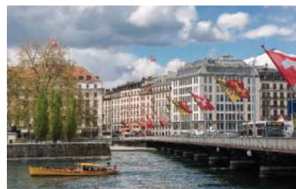
Hotel Bristol Geneva