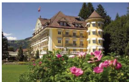
Le Grand Bellevue, Gstaad

This luxurious property on the banks of Lake Geneva has its own Michelin-starred restaurant, a Thai restaurant, regal bedrooms, and an enviable location in the city. On the outside, French balconies are decorated with blue flowers, and inside an authentically recreated Roman atrium provides a wholly unique place to relax. read more