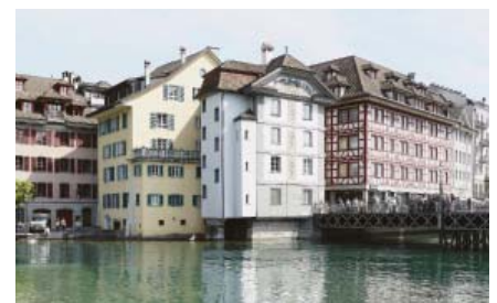
Hotel Wilden Mann, Lucerne