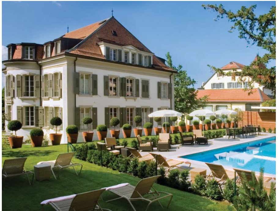
Hotel Angleterre et Residence, Lausanne

This elegant spa hotel has a stunning, palatial façade, beautifully grand, ornate rooms, and convenient tennis facilities. Diverse internationally-inspired dining options provide plenty of indulgent options for evening meals. From the outdoor pool, guests can see Lake Geneva, and the mountains on the other side. This hotel is just a short walk from Ouchy Harbour. read more