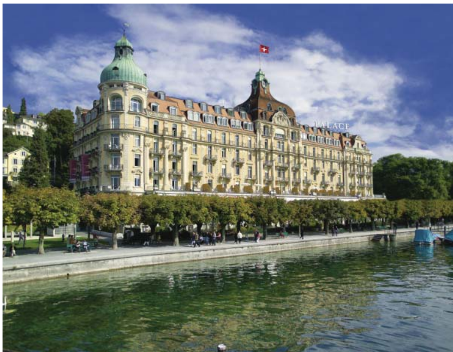
Palace Luzern, Lucerne

Just a short walk from Gstaad's main boutiques, cafes, and restaurants, Le Grand Bellevue is a highly convenient hotel immersed in the picturesque lifestyle of the Saanenland. Its pale yellow façade is palatial in design, with a distinctive tower that shapes some of the hotel suites. Equipped with a Michelin starred restaurant and an indulgent spa, this is a luxurious property in which to spend two or three nights while you explore the Saanenland. read more