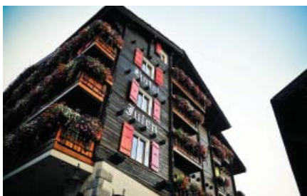
Romantik Hotel Julen, Zermatt

Hotel Wilden Mann has been hosting guests for over 500 years; first as a bar, then as a tavern, and now as a luxury hotel. Inside, the original winding corridors and traditional elements remain, adding further quiriness to the building that clings to the edge of the river. The lovingly decorated rooms have antique furnishings, abundant character, and a very classical style. read more