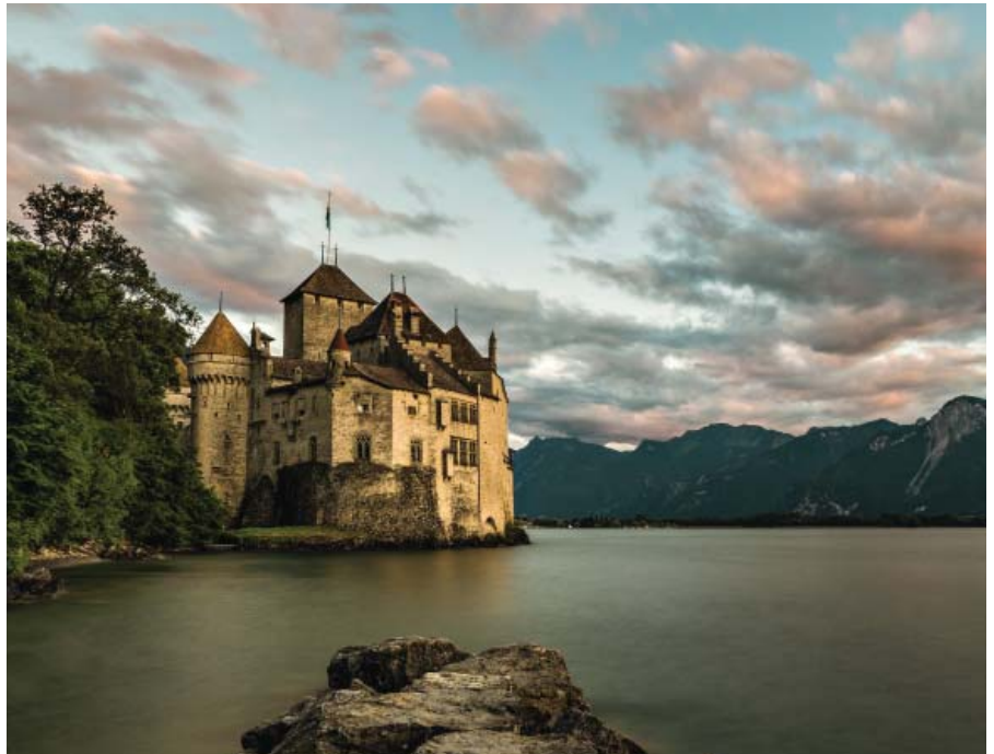
Chillon Castle, Lake Geneva

Travel via some of the most scenic and charming rail routes in Europe, passing forested valleys, Alpine meadows, sublime lakes, and historic old towns. This romantic touring holiday takes you from Lake Geneva, down into Mediterranean-style Ticino, back up to Lake Lucerne, and then into the lush countryside of the Saanenland.