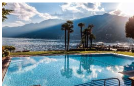
Eden Roc Hotel, Ascona