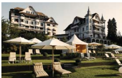
Hotel Park Weggis, Lake Lucerne