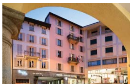
Hotel Lugano Dante, Lugano