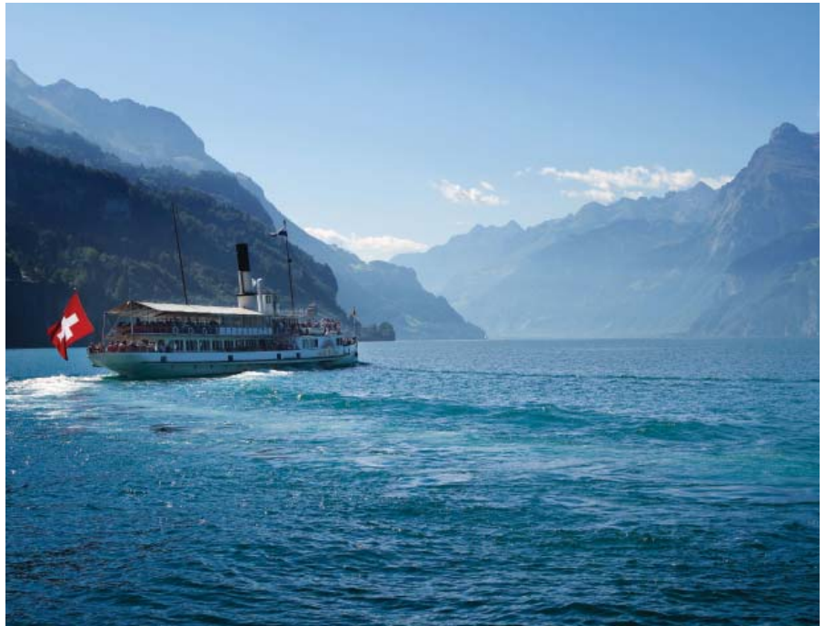
Paddlesteamer on Lake Lucerne

Wilhelm Tell, the Swiss National Hero of Liberty, is one of the best known folk characters in Switzerland. Friedrich von Schiller penned the most popular recounting of Tell's fable in his poem, which is still performed in Switzerland more than 200 years later. Begin your Wilhelm Tell Express touring holiday with three nights in Lucerne before boarding the Wilhelm Tell Express boat across Lake Lucerne. Pass such iconic locations as the Rutli Meadows and Tell's Chapel at Sisikon. When you reach Fluelen on the southern shore of the lake, disembark and board the train to Locarno. The journey south is lined with snow-capped peaks, interspersed with dramatic valleys, and broken up by a number of historic, picturesque towns. At Bellinzona, change for Lugano, where you will spend two nights before heading to Milan or Zurich for a return flight or train.