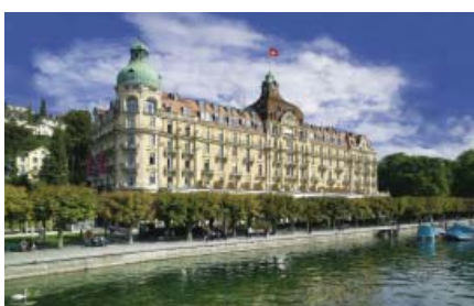
Palace Luzern, Lucerne

Housed within a late 19th century mansion, the Grand Hotel Villa Castagnola channels aspects of Mediterranean culture in its pale-peach façade, its summery garden, and the dining experiences on offer. Guestrooms have wholly unique touches to ensure that every stay here is different, and the swimming pool, lounges, and bars encourage guests to keep returning. read more