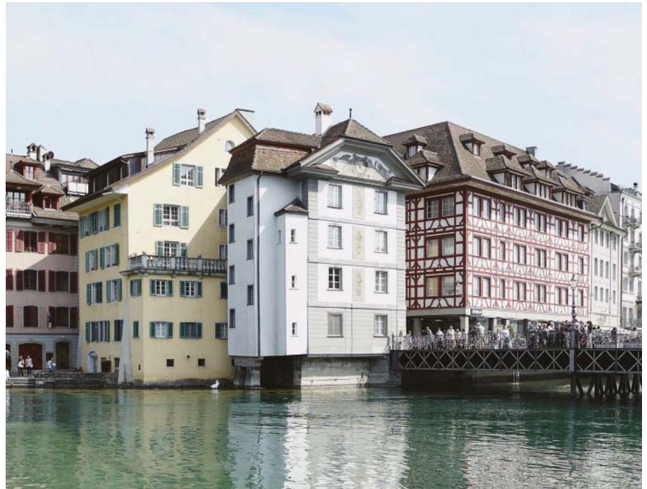
Hotel Wilden Mann, Lucerne

The lakefront Palace Luzern is in a very prestigious area, flanked by houses equally as palatial as the hotel itself. Light airy rooms follow either a traditionally elegant style, an art deco design, or are sleek and modern. Higher category rooms feature works by Miro, Kandinsky, and Chagall. The gourmet restaurants are unique in Lucerne; one serving exclusively seafood. A highlight is the tempting and luxurious spa. read more