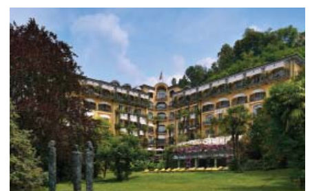
Grand Hotel Villa Castagnola, Lugano