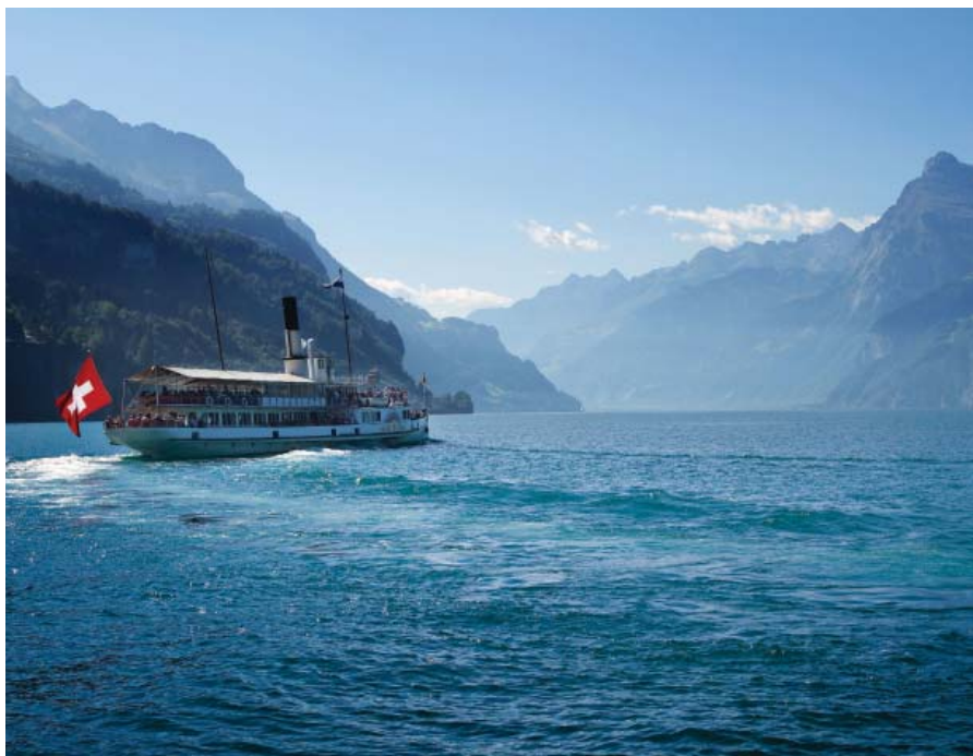
Paddlesteamer on Lake Lucerne

Wilhelm Tell, the Swiss National Hero of Liberty, is one of the best known folk characters in Switzerland. Friedrich von Schiller penned the most popular recounting of Tell's fable in his poem, which is still performed in Switzerland more than 200 years later. Begin your Wilhelm Tell Express touring holiday with three nights in Lucerne before boarding the Wilhelm Tell Express boat across Lake Lucerne. Pass such iconic locations as the Rutli Meadows and Tell's Chapel at Sisikon. When you reach Fluelen on the southern shore of the lake, disembark and board the train to Locarno. The journey south is lined with snow-capped peaks, interspersed with dramatic valleys, and broken up by a number of historic, picturesque towns. At Bellinzona, change for Lugano, where you will spend two nights before heading to Milan or Zurich for a return flight or train.