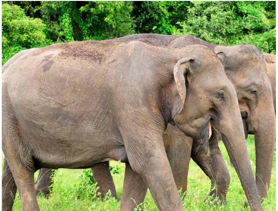
Sri Lankan elephants

Negombo • Sigiriya • Polonnaruwa • Kandy • Yala • Galle • Bentota