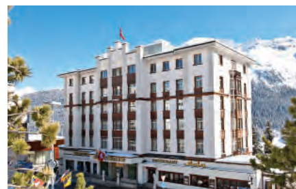
Hotel Schweizerhof St Moritz