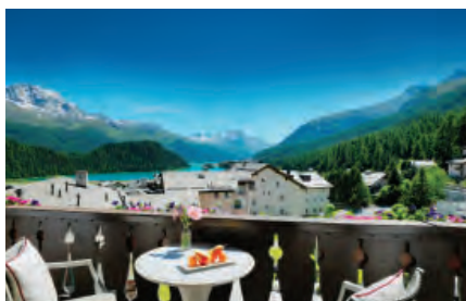
Giardino Mountain, St Moritz