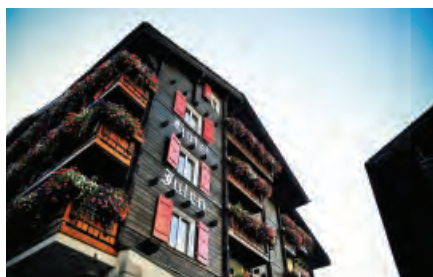
Romantik Hotel Julen, Zermatt

The first hotel to be built in St Moritz, the Grand Hotel des Bains was constructed in 1864 at the source of the Mauritius springs. This grand spa hotel offers traditional elegance with an Italian palazzo-design in a breathtaking alpine location. Make the most of the excellent spa facilities, a range of dining options and golf and tennis facilities.