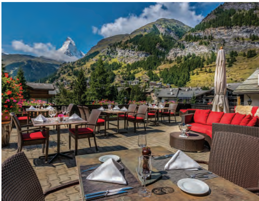
Hotel Christiania, Zermatt

A historic, chic property, the Grand Hotel Zermatterhof may well be the most prestigious hotel in Zermatt. Positioned in the centre of the village, it is just a minute's walk from the main church, a park, the best restaurants in Zermatt, and the Matter Vispa. The rooms blend state-of-the-art comfort with regal charm.