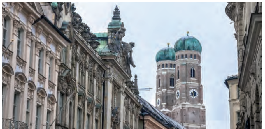
Munich (if coming back by train)

Enjoy a full German breakfast at your hotel before you check out and begin your journey back to London. You will take a train from Munich to Brussels with an easy change of trains in Frankfurt before boarding the Eurostar to London St Pancras.