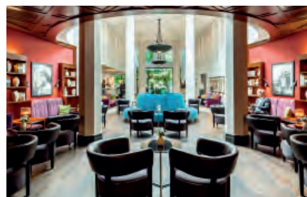
Charles Hotel, Munich

Hotel Torbrau is a family-owned hotel superbly situated at the gateway to Munich's Old Town. Rooms are comfortable, and the hotel offers a restaurant and restored wine cellar.