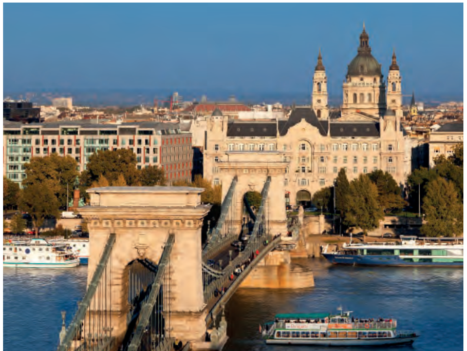
Chain Bridge, Budapest

Enjoy two full days in Budapest exploring the tree-lined boulevards of Pest and the cobbled hilly streets of Buda. The city straddles a curve in the River Danube and is packed with interesting sights to visit on foot but also easily reached by underground. Visit the Castle District in Buda where you can find mediaeval buildings such as the Royal Palace which has been rebuilt several times over the past seven centuries and houses the National Gallery, Budapest Historical Museum and the Museum of Contemporary Art. You can also visit the 13th Century St Matthias Church and the