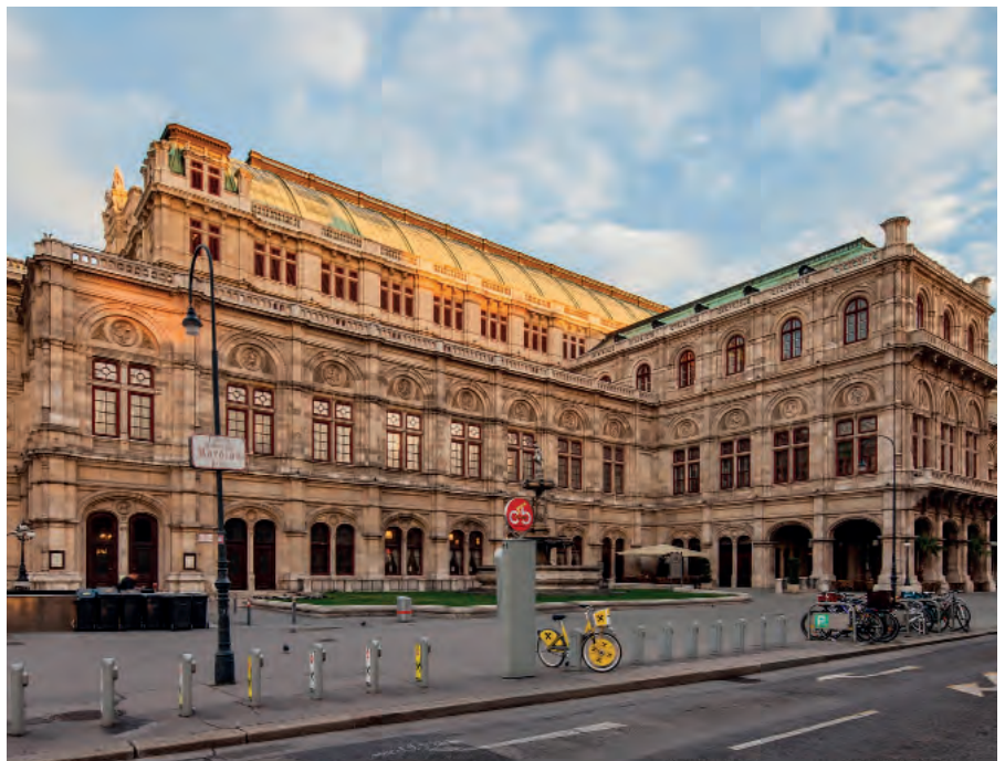
Opera House, Vienna

Salzach River flow through the city centre and the old town is on the left bank where you can find the Hohensalzburg Fortress, an 11th century castle which sits upon the Festungsberg. Other places of interest include the Mirabell Palace Gardens – a UNESCO World Heritage Site - and Mozart's birthplace, a museum which tells the compelling story of his life, relationships and musical inspirations. Today, the Salzburg Festival in July and August each year, offers an array of opera, music and drama.