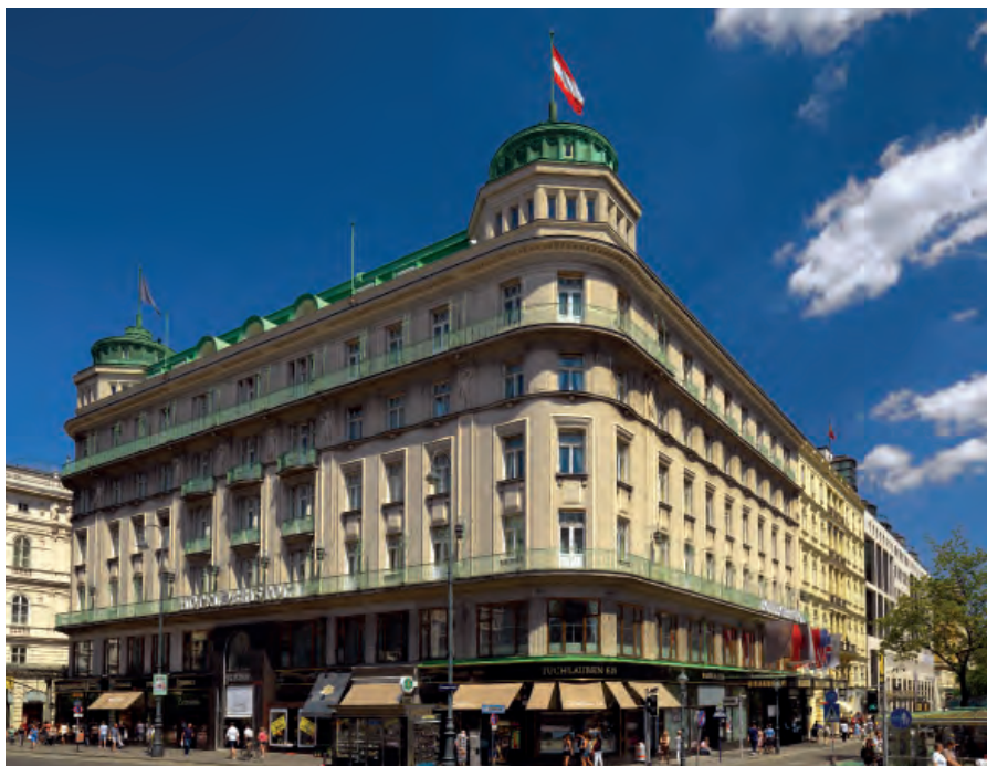
Hotel Bristol, Vienna