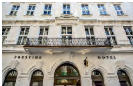
Hotel Prestige, Budapest

Aria Hotel Budapest is a superb hotel situated on the Pest side of the river, within walking distance of Parliament building and Váci utca (the pedestrianised shopping street). The hotel enjoys a rooftop bar which offers views of the domes of St Stephen's Basilica as well as a spa area. There are 49 vibrant rooms and suites with contemporary, elegant décor.