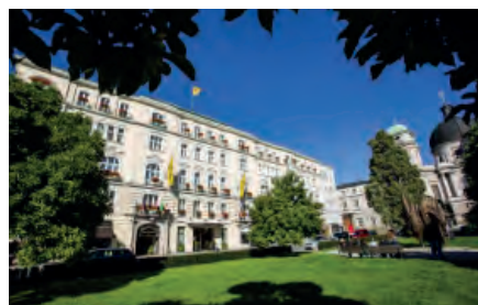
Hotel Bristol, Salzburg

Hotel Goldgasse, a member of "Small Luxury Hotels" is situated in Salzburg's old town, a short walk from Salzburg Cathedral and Mozart's birthplace. This boutique hotel has the feel of a private residence and offers just 16 rooms and suites which are each dedicated to a performance. Hotel Goldgasse also enjoys a breakfast room with terrace serving homemade delicacies.