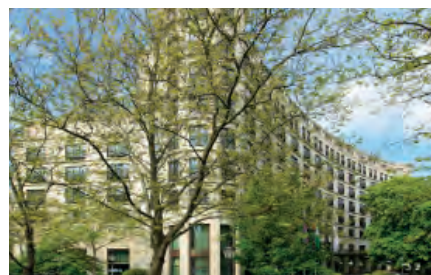
Charles Hotel, Munich