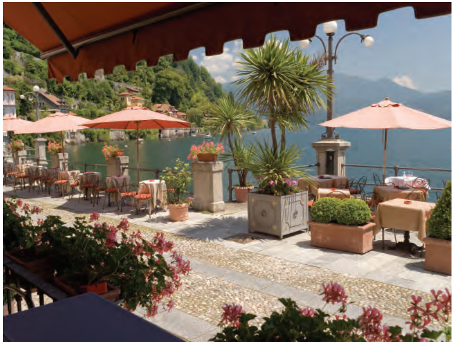
Terrace at Hotel Cannero

Leaving Zurich behind at midday you head east to Bern where a simple change then drops you down past Lake Thun and through the Simplon Pass, arriving in Stresa around 4pm.