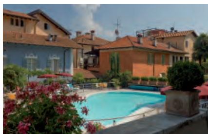
Swimming pool at Hotel Cannero