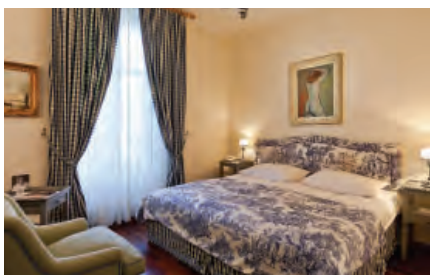
Superior room at Hotel Angleterre et Residence

The welcoming Hotel Cannero reflects the quaint charm of its picturesque surroundings, offering attentive service to ensure that guests feel relaxed and well looked after. The original 17th century building has been restructured to make the most of its excellent position. The light and airy bedrooms feature balconies overlooking the serene lake, whilst excellent meals are served from the restaurant's lakeside terraces. The hotel has two bikes and a rowing boat "Rebecca II" which are free for guests to use during their stay.