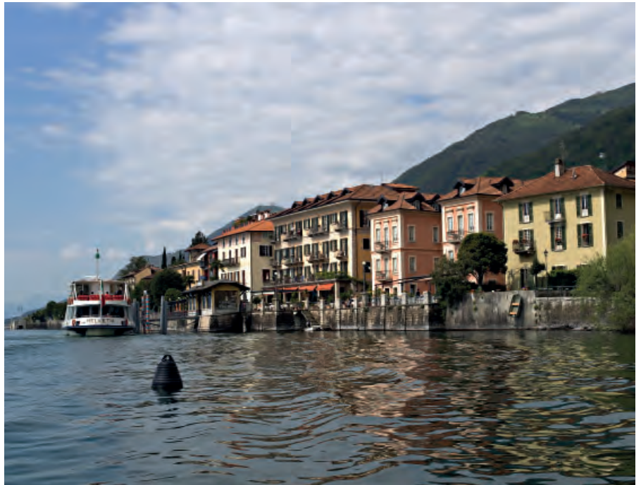
Hotel Cannero from the water

The Hotel Ambassador a l'Opera is a historic boutique hotel located opposite Zurich's Opera House, set just back from the lakeside. This is a highly luxurious and unique option for a one or two night stay in central Zurich. The hotel has just 45 rooms and is renowned for their gourmet restaurant which is just as popular with locals as hotel guests.