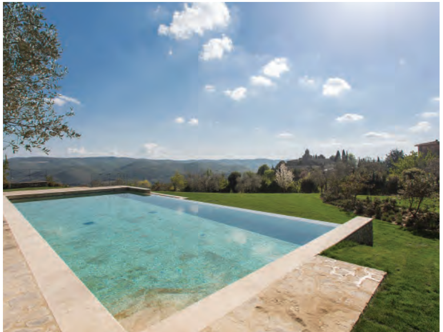
Infinity pool at Villa le Barone

Spend 6 days exploring the Chianti region and the fascinating art cities of Tuscany. Take the opportunity to discover the patchwork vineyards of Montalcino, the spas of Montecatini and Saturnia and the islands of Elba and Giglio. However you choose to spend your time in Tuscany, you will be inspired by the beauty of your surroundings