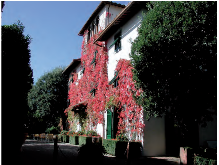
Villa le Barone

The Eden Hotel Wolff has been one of the leading names in Munich since its foundation in 1890. The Art Noveau building is ideally located opposite Munich Central rail station, making it the perfect stopover point from which to explore the city. The hotel has 210 rooms and suites on offer to guests in a variety of designs from classical through to elegant modern or Alpine stylings, whilst the hotel's restaurant the Peter & Wolff prides itself on the use of seasonal products from the regions suppliers in its menus.