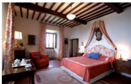
Villa le Barone