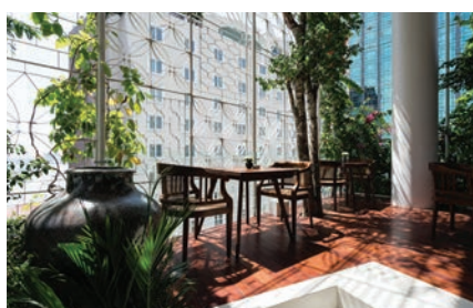
The Myst Dong Khoi, Ho Chi Minh City