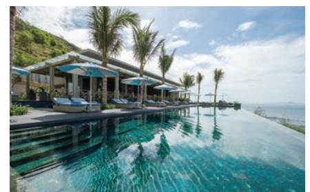
Mia Nha Trang Resort