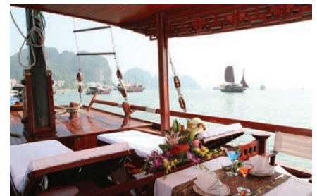
L'Amour Junk, Ha Long Bay