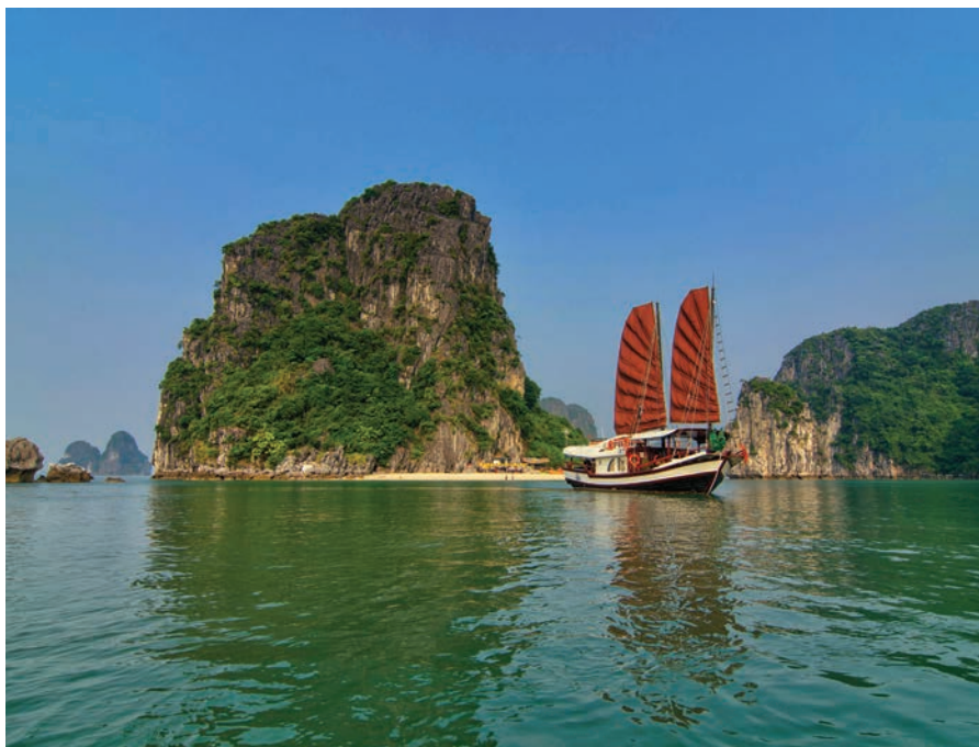
L'Amour Junk, Ha Long Bay

Your destination is Sapa, perched on the mountainside opposite Mt. Fan Si Pan, Vietnam's highest peak. Sapa is in a scenic valley, surrounded by the mountains and with hillside rice terraces. The ethnic communities live in numerous villages, tucked away on the lower slopes of the valleys, and many villagers wear authentic traditional costumes. The