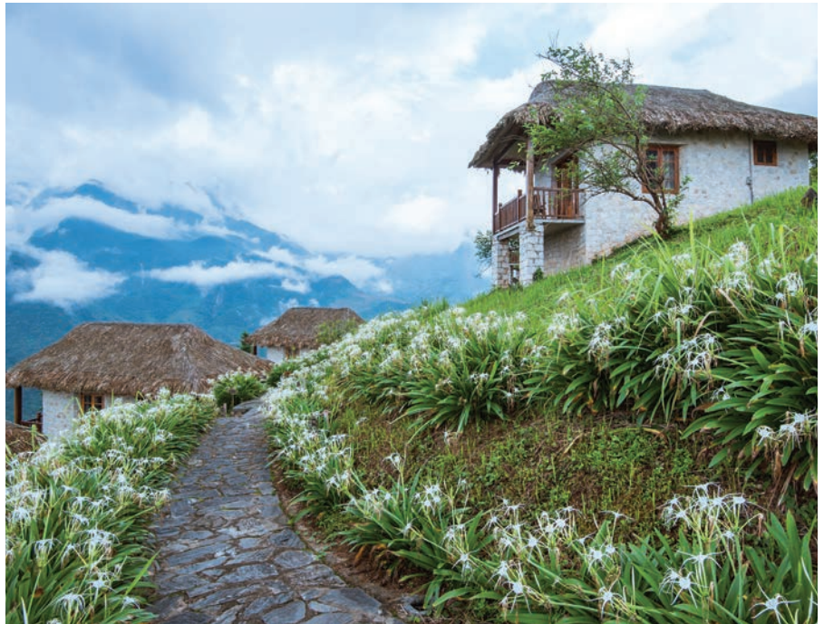
Topas Eco Lodge, Sapa

4-star boutique hotel with charismatic modern design, harbouring relics of Saigon's past – Saigon Signature Suite room.