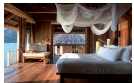
Six Senses Ninh Van Bay, Nha Trang