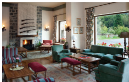
Parador de Fuente De

Restaurant, Bar, Lounge, Children's Playground, Games Room, Free WiFi, Gift Shop, Luggage Room, Lift, Parking.