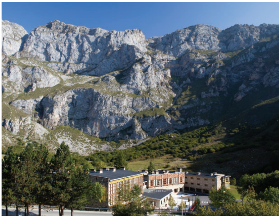
Parador de Fuente De