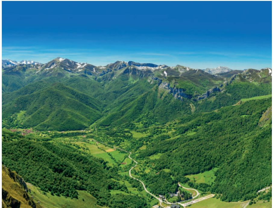
Picos de Europa scenery

This seven-night, self-guided walking holiday invites hikers to explore a little-known region of northern Spain, the Picos de Europa. This mountain range is part of the Cantabrian mountains of northern Spain, straddling the regions of Asturias, Cantabria and Castile and Leon. There are three massifs with the highest summit of Macizo Central reaching 2648m. Encompassing all three massifs is the National Park of the Picos de Europa. This is a landscape of dramatic limestone mountains, beautiful alpine meadows and charming rural villages of terracotta-roofed houses, arcaded and adorned with heavy timbered balconies. There are mountain lakes, sheer rock faces and river gorges. Explore the very heart of the Picos de Europa National Park using your hire car and the Fuente De cable car. This summertime walking holiday for individuals includes itineraries which discover the region via a variety of well-marked trails. Return to the Parador de Fuente De each evening for a hearty meal of regional specialities in the Parador's restaurant.