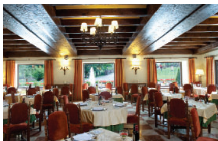
Parador de Fuente De