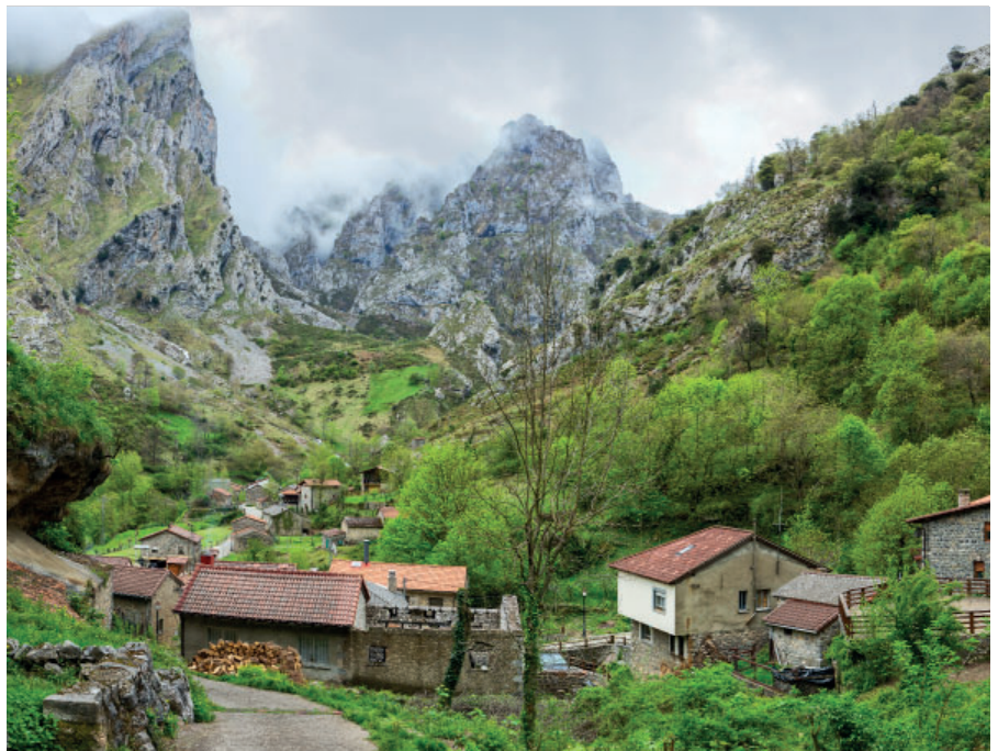
Picos de Europa scenery

Today's route takes you up and into the mountains, using the cable-car which is located right next to the hotel. These glass-sided cabins whisk you up and away out of the village, with jaw-dropping vistas all around. The journey takes a little under 4 minutes to climb 2,500ft to the upper station where you