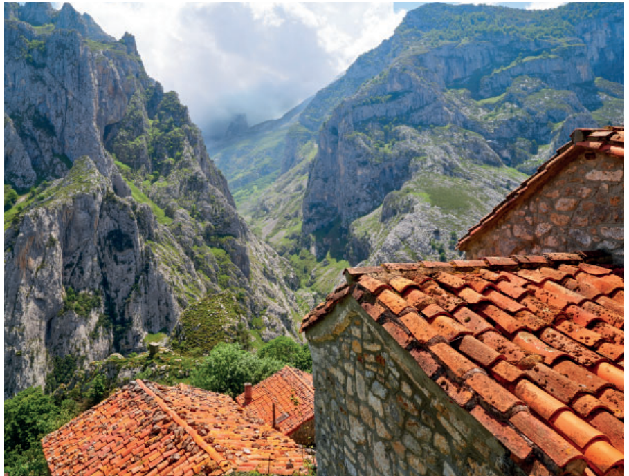
Picos de Europa scenery

the Picos de Europa. On a clear day you can see the Liébana valleys, Peña Sara, Peña Prieta and the peak of El Coriscou in the background. The route then continues across the hilltop to then wind back down the hillside between tall oaks and beech trees, eventually arriving back at Pembroes church where you left your car. Head back to the hotel and enjoy a final regional dinner before turning in for the night.